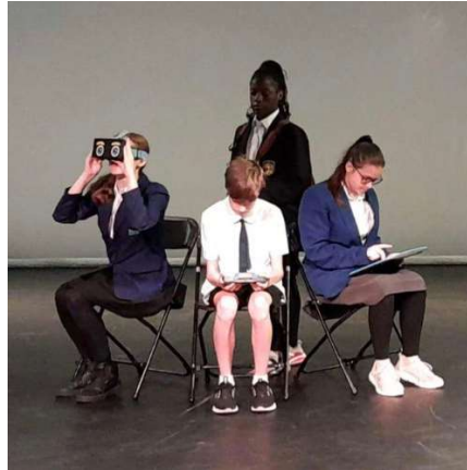
MovementWorks® ‘Artistes for Autism’ performance shot at WAF Community Day of Dance