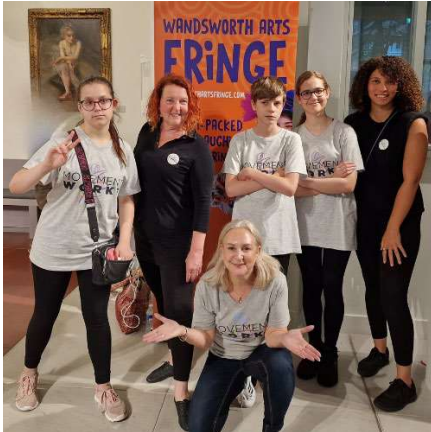
MovementWorks® ‘Artistes for Autism’ at the Wandsworth Arts Fringe (WAF)

A short documentary of that project can be viewed on our website on the ‘Artistes for Autism’ webpage.