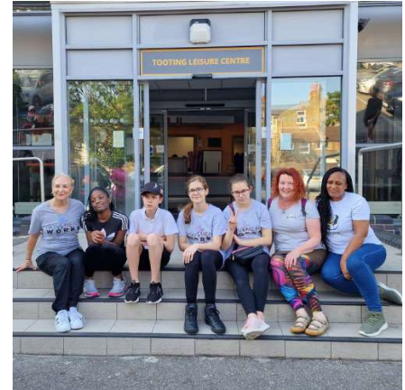
MovementWorks® ‘Action for Autism’ group outside Tooting Leisure Centre

Both of these Wandsworth projects were enhanced by our partnership working.