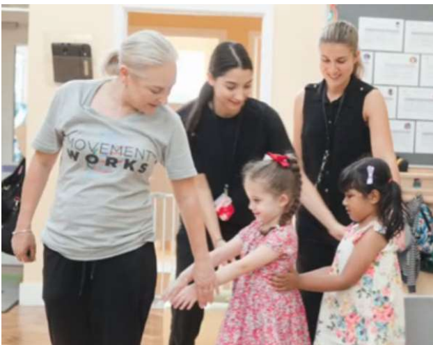
MovementWorks® BBC Children in Need: The Ohana Centre

During 2023 our Children in Need Year 4 award allowed us to extend our reach to three groups of children with complex needs at Carters Sunflowers Nursery, a specialist provision for autistic children with social and communication needs, and also to work with a new group of children with similar needs at The Ohana Centre, a specialist SEN Nursery in the London Borough of Hammersmith and Fulham.