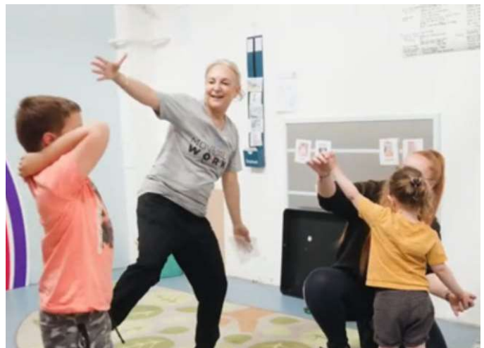
MovementWorks® BBC Children in Need: Carters Sunflowers Nursery