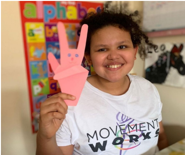
Developmental Dance Movement Online Programme