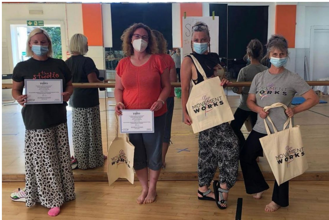
Some of the graduates from our Autism Movement Therapy® Level II Training

We were also able to reinstate our CPD and training programmes including the previously postponed AMT (Autism Movement Therapy) Level II Training Workshop.