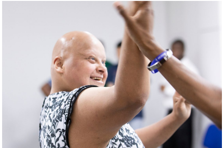
Autism Movement Therapy with Share Community for Adults with Learning Disabilities