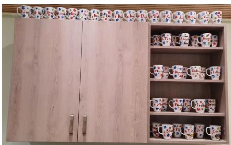
Left: named mugs for each of our Pound Founders, on display in The Pound

The Trustees are pleased to be able to report that the charity is in a sound state as we move forward, and thank all who have contributed. Great credit is given to all who have volunteered their skills and time, throughout this challenging period.