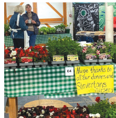
Top: Walk With Us event Bottom: LOSRRAS Plant Sale at Linklater Pavilion