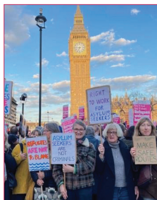
Top: Delband at The Friends' Meeting House to celebrate Refugee Week