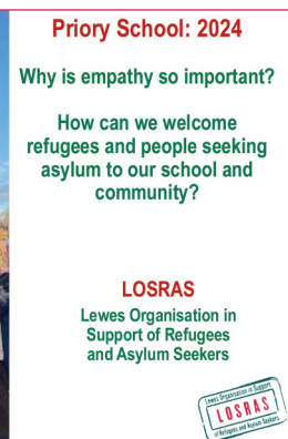
Above: Priory School lesson