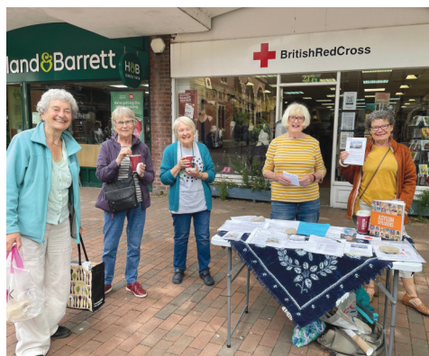
Above: Refugee Week Stall, Lewes Precinct