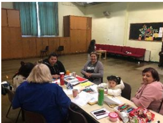
Picture 13 - Family engagement

We have also been funded by SEK (Social Enterprise Kent) for creating a campaign that will promote various jobs to migrant communities and also enable employers to recruit easier.