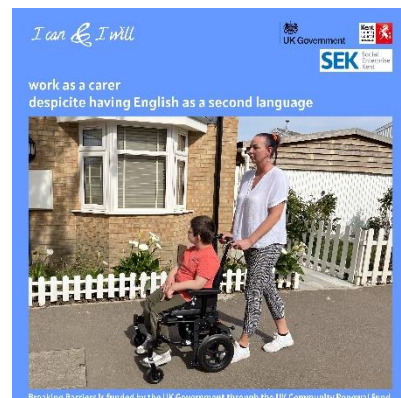
Picture 14 - Campaign