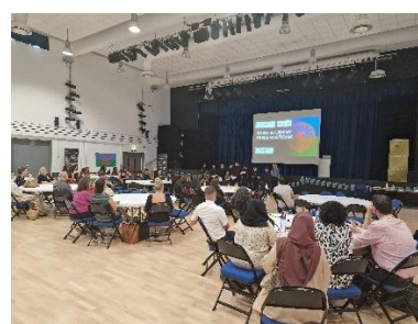
Picture 10 – Roma Day Peterborough