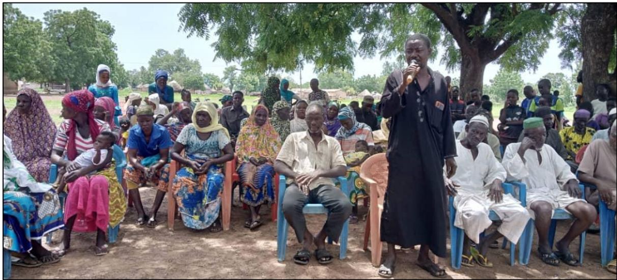
Tamaligu Community Listener Group participants hear one of their colleagues providing feedback after listening to an episode of the T2T Radio Programme