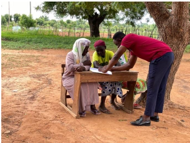
Parent endline survey