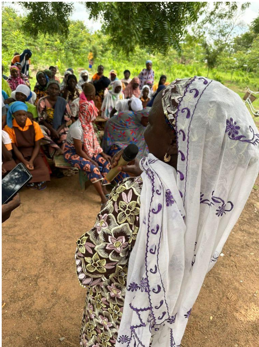
Women advocating at Community Listening Group