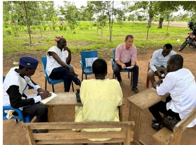
CVT monitoring and support - feedback session after classroom observation