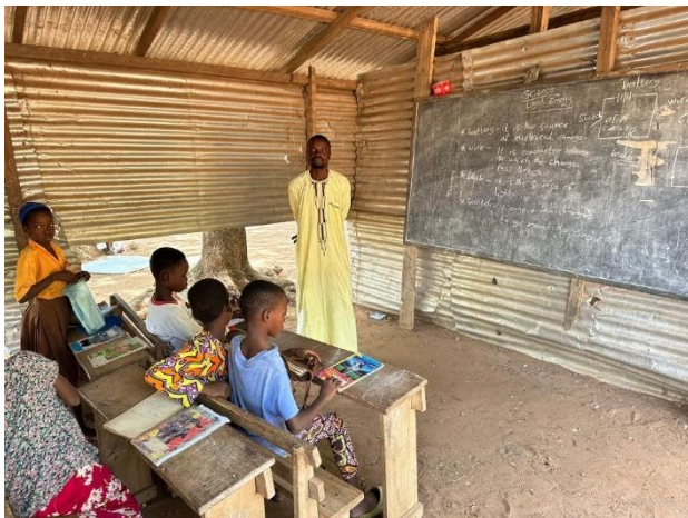
Community Volunteer Teacher delivering science lesson to students