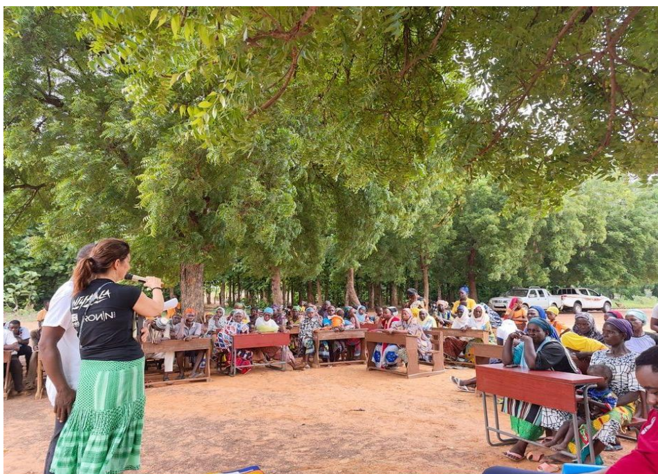
Parents participating in Community Listener Group with senior community members fully engaged in the process