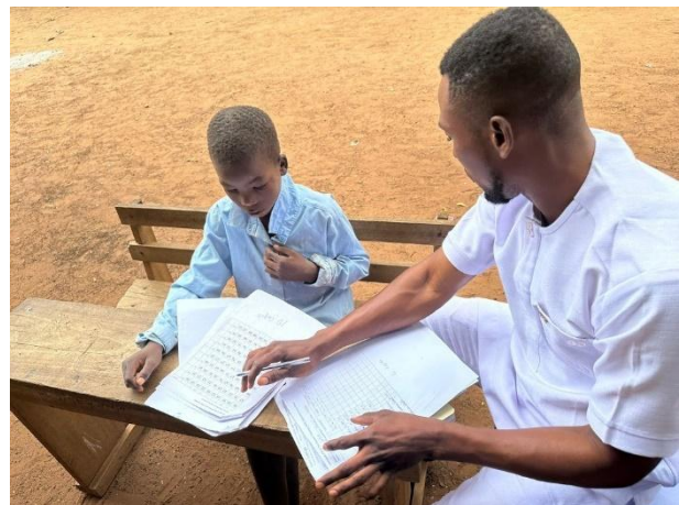
Monitoring and evaluation student endline assessment