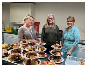
Three of our amazing volunteers at our tea parties

One hour can change a life. Befriended could and would not function without our amazing volunteers. Our volunteer base has grown due to all the different initiatives we now offer. We have volunteers who help at our tea parties, chaplaincy, balance classes as well as befriending. Our 'one hour can change a life' campaign has been successful in bringing new volunteers. All our volunteers are DBS checked, have training and safeguarding training.