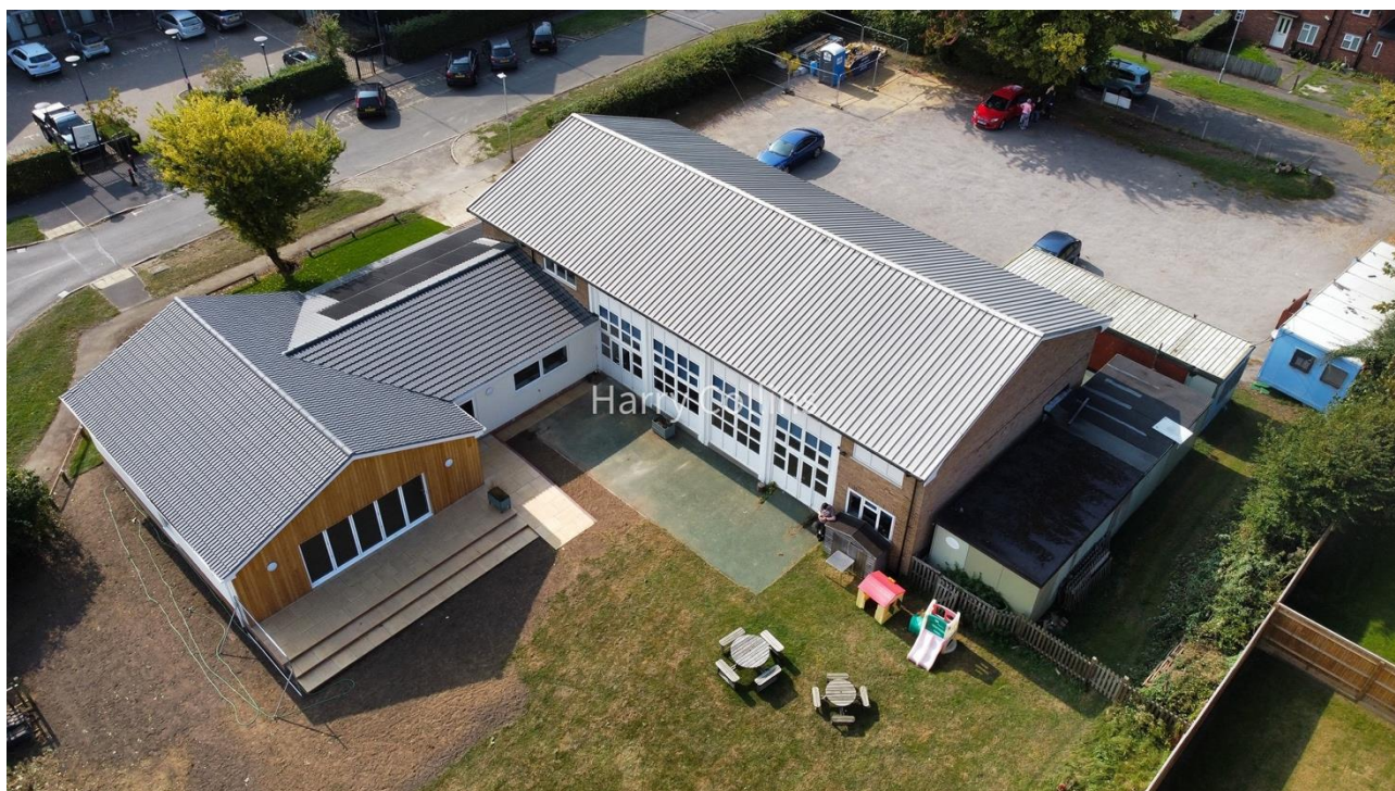
Neighbourhood Centre Complete Sept 2021

This new facility increases our surface area by over 50% and is being used to make a change in our community engagement and mission. In time, we hope to offer many community enhancing activities. Amongst those that have been suggested are a café for older and younger people to encounter and enrich each other through friendship and helping to tackle isolation, providing life skills, money management, job support, refugee support, and a community garden project.