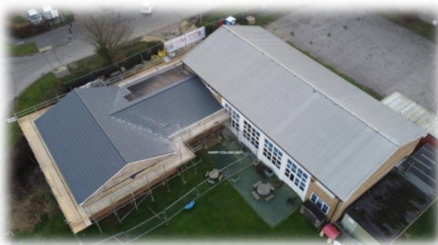
Neighbourhood Centre progress end of December 2020

This project will increase our surface area by over 50% and we plan to use it to make a step change in our community engagement and mission. We will be able to host the Woodley foodbank that gives out about 70 parcels a month. We plan to offer many community enhancing activities including a café for older and younger people to encounter and enrich each other through friendship, helping to tackle isolation. Provide life skills, money management, job support, recycle café, mental health wellbeing support group and a community garden project. The space will be suitable for community groups and for small meetings such as counselling sessions. We foresee the growth of our children's and youth ministries.