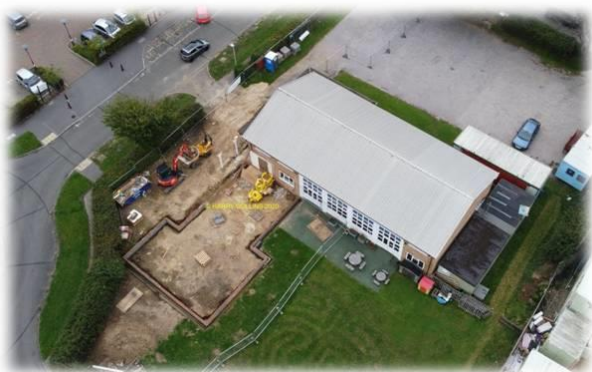
Neighbourhood Centre progress early Sept 2020

In March, the PCC took the decision to authorise the building of our new Neighbourhood Centre to begin, with finances and progress being carefully monitored by the building team, who in turn reported and were accountable to the PCC. The existing portacabins on site were moved to the car park side of the building and were externally painted with colourful land and seascapes by members of our church. They continue to be used as the town's foodbank centre and for storage. Our contractor began the building work in August with a scheduled completion of August 2021.