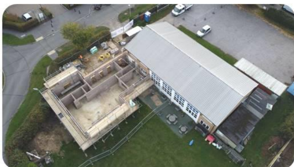
Neighbourhood Centre progress Oct 2020