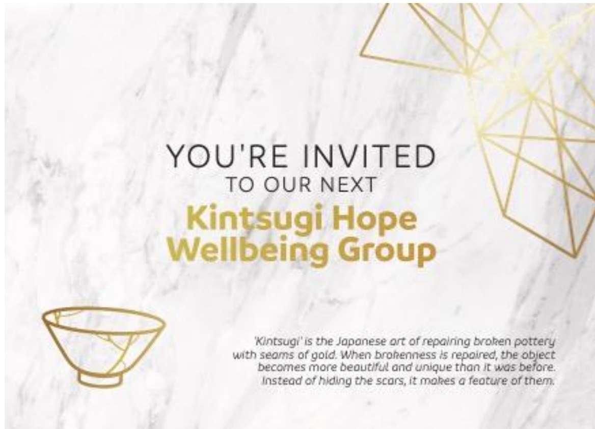
Example invitation for Group Leaders to use to invite people to their wellbeing group.