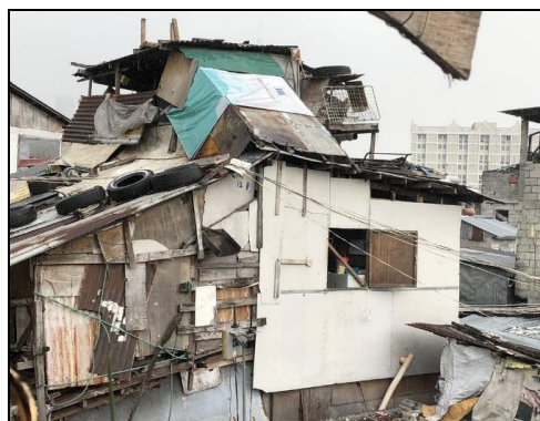
Some of the living conditions in the Philippines