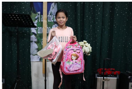
A child receiving a Christmas gift through the Child Sponsorship Programme (CSP)

Thank you to St. Thomas' Church for all your support of Hands of Mercy over the years. Many of you have heard of us – but don't let that stop you reading on if you have! If you haven't, we are a Christian charity restoring hope to some of the poorest families in the Philippines. We do this through the local church – partnering with churches like St. Thomas' – and also individual Christians and groups.