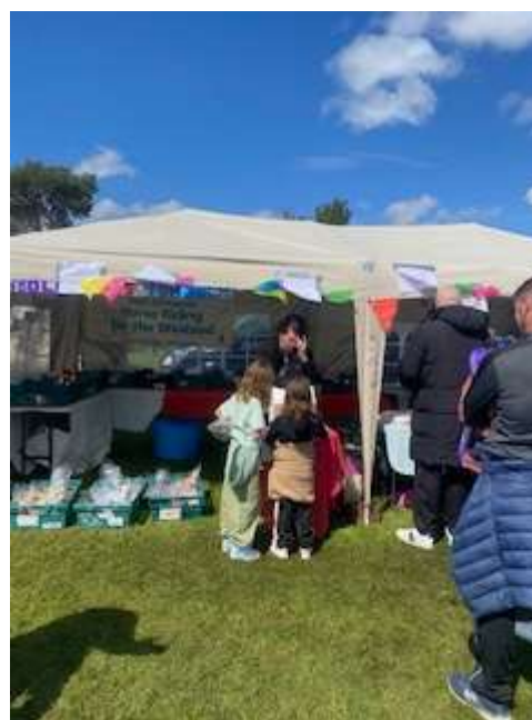
May Bank Holiday Gala Fundraising Event