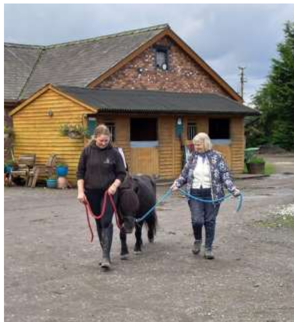
Participants of Tea with a Pony enjoying time in the sun.