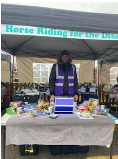
Easter Fundraising Event