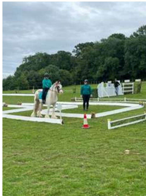
National Championships at Hartpury Countryside Challenge Class