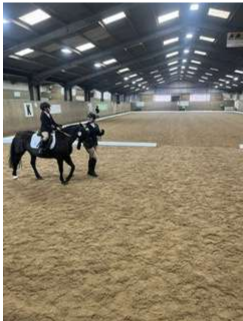
National Championships at Hartpury Dressage Class

Representing the Charity at a national level is a remarkable achievement for our participants, volunteers, and horses. Their success reflects the hard work, resilience, and teamwork that define East Liverpool RDA, and we are incredibly proud of everyone involved.