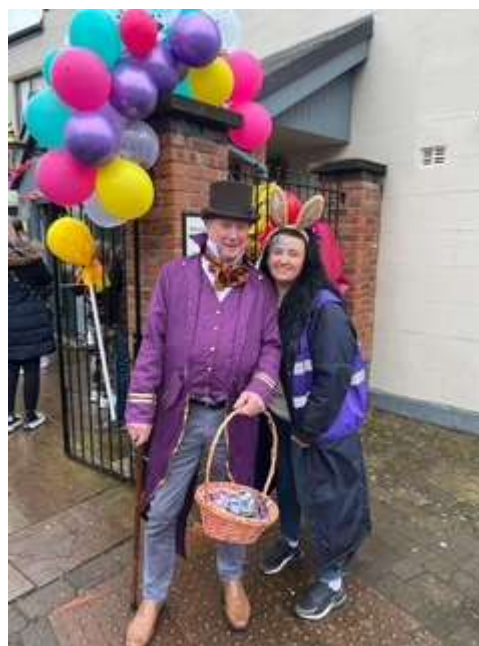
Our Community Easter Fundraising Event