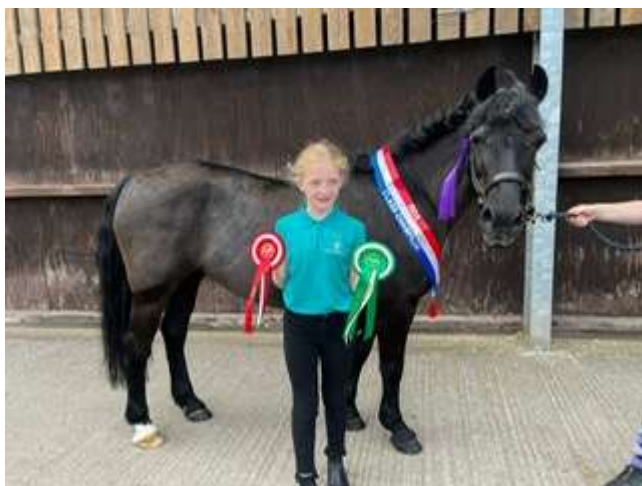
National Championships at Hartpury Placed First in Dressage Class