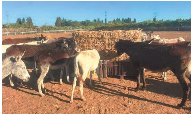
The new feeding containers.