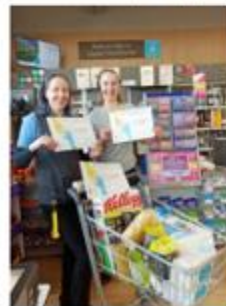
Upper Cambourne Co-op Staff with some of the items generously donated by residents

Look out for the trolleys where you can donate items in the Co-op Stores in Upper and Lower Cambourne and in Morrisons supermarket.