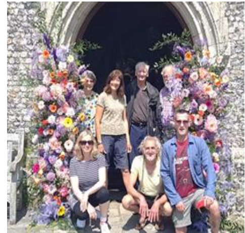
The Bell Ringing Team