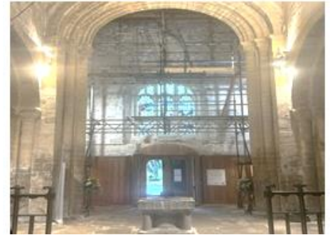
Internal Church Repairs