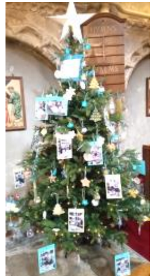
Christmas Tree Festival

The weekly guided tours of St Mary's during the summer months and during the national Heritage Open Days festival in September also attracted people to the church from near and far. In October, Wordfest – Shoreham's annual literary festival – held events in church including a very well-attended evening in conversation with Hugh Bonneville. Additionally, the church continued to open its doors for 'Light Up Shoreham' and the monthly Farmers' Market. Last but not least, the Christmas Tree Festival in early December – held in aid of the Friends of St Mary's – was again a tremendous success, with over a thousand visitors over the