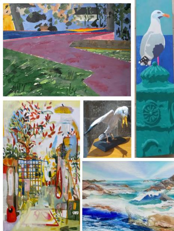
Some Arts Festival Submissions

The weekly guided tours of St Mary's during the summer months and during the national Heritage Open Days festival in September also attracted people to the church from near and far. In October, Wordfest – Shoreham's annual literary festival – held events in church including a very well-attended evening in conversation with Hugh Bonneville. Additionally, the church continued to open its doors for 'Light Up Shoreham' and the monthly Farmers' Market. Last but not least, the Christmas Tree Festival in early December – held in aid of the Friends of St Mary's – was again a tremendous success, with over a thousand visitors over the