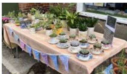
Pop Up Shop Plants

reflecting our charism at St Mary's to be community of both depth and openness.