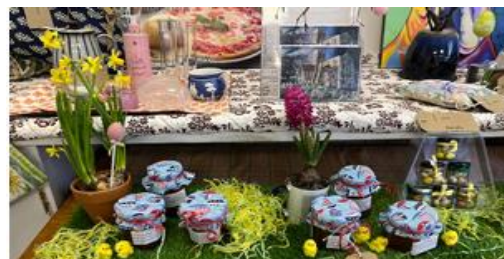
Pop Up Shop Produce