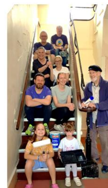
Volunteers working on