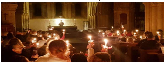
Figure 10: Christingle Service