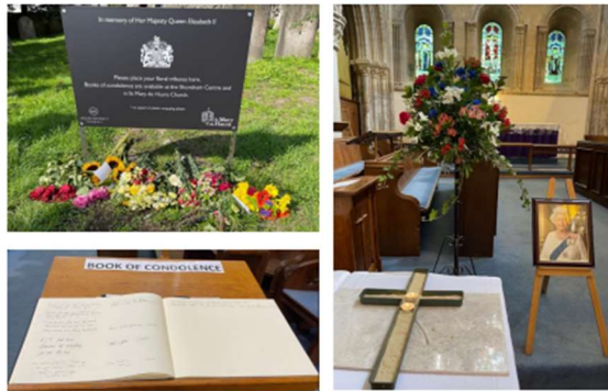
Figure 3: Commemorating the Queen