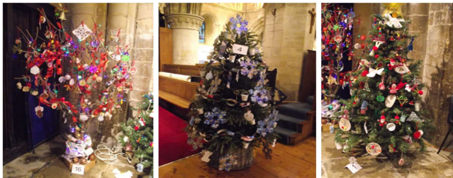
Fiaure 8: Christmas Tree Festival Winners