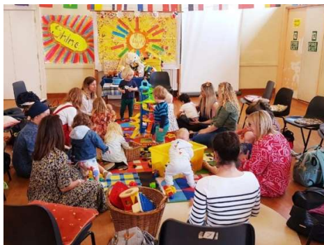
Figure 9: Queen's Jubilee Children's Service