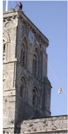
Figure 2: Teddy's Zip Wire