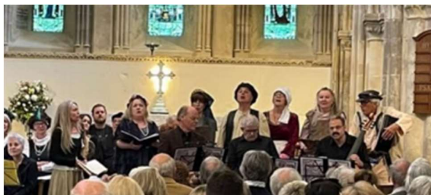
Figure 12: Wordfest event in church