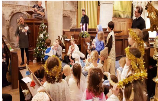
Figure 11: Shine Pop Up Nativity