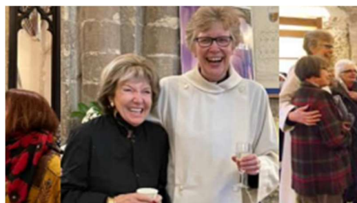
Figure 1: Reverend Canon Ann's leaving party