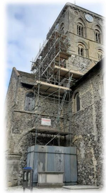
Scaffolding on the tower

We successfully applied for a grant of just under £15k from Historic England which covered the majority of the costs for this, and for which we are very grateful.