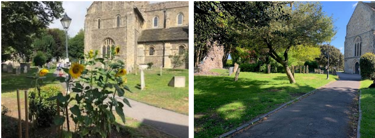
Precious Green Spaces in the Churchyard

The subgroup of the Parochial Church Council has continued to work with our architects, Acanthus Clews, on plans for the development of the church buildings. As reported last year, the PCC has taken the decision to focus initially on the redevelopment of the St Mary's Hall site to provide the necessary accommodation for administration and the programme of events so vital to our aims and objectives, outlined earlier in this report, and to generate much needed income to support the church in the years to come. The need for this income stream has been reinforced this year in our struggle to meet all the running costs of the church. Alongside this we hope to secure grant funding for landscaping within the churchyard which is such an important green space for the town, never more so than during the Pandemic. We hope to be able to start consultation on these initiatives with the congregation and wider town within the calendar year of 2021. Your prayers for this whole project are much appreciated.