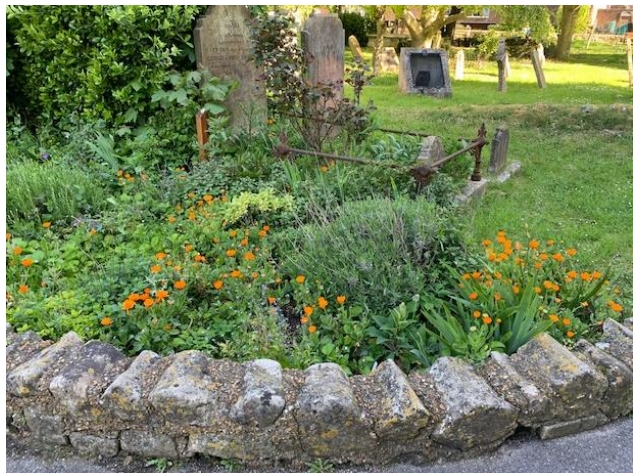
Flower Beds in the Churchyard