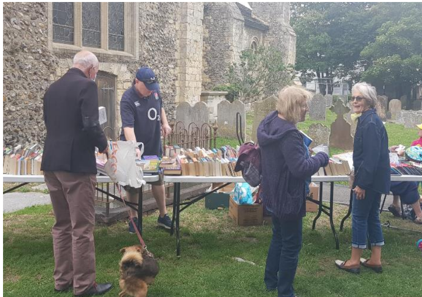
Pop Up Stall in the Churchyard

In the autumn, one of the local shopkeepers requested use of the church for a monthly meeting of local small retail businesses for mutual support and sharing of ideas and we have been pleased to accommodate this.