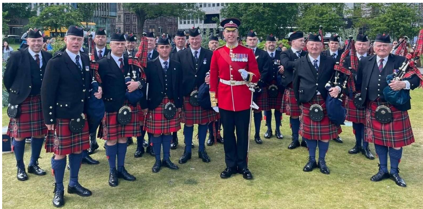
Scots Guards Association Pipes & Drums (Scotland) who played at the Falklands 40 Commemoration in St Andrew's Square, Edinburgh.