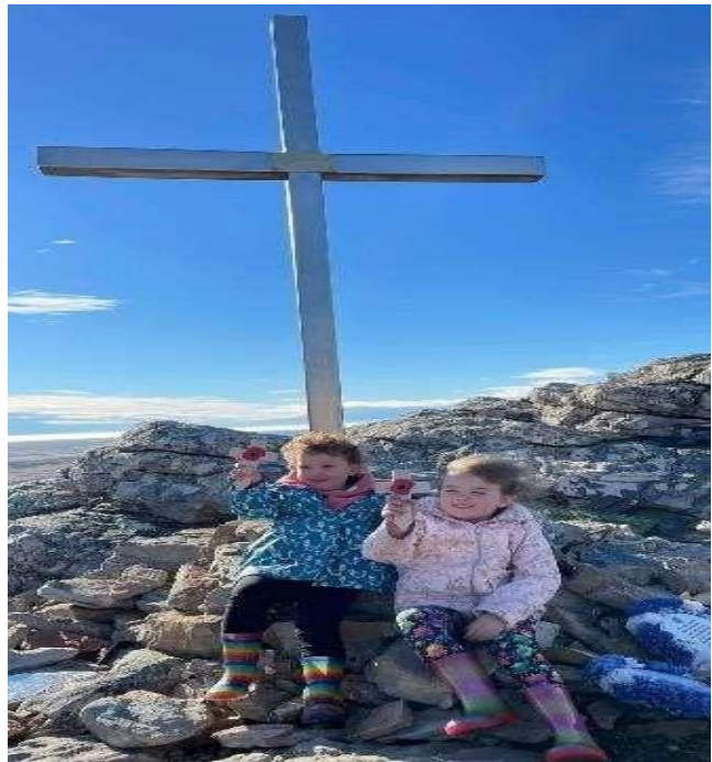
Children of the Falkland Islands with Poppy Crosses on Mount Tumbledown.

Our trustees tightly control allocation of available funds according to priority and even though we conserve resources by seeking external sources of aid, there is normally a shortfall. While the Covid pandemic has resulted in reduced expenditure this year, due to lower demand and constraints on social worker visits, the backlog of cases will probably cause an upsurge of expenditure when the constraints are eased. As it stands today, we remain reliant upon the generosity of individuals through annual donations to avoid the Regiment having to cut its welfare or welfare-related spending of over £300k annually. At the same time, demand for funds is continually increasing, driven by recent heightened military activity, higher survival rates after serious injury, a general increase in life expectancy and inflation. Unexpected costs, like providing legal defence to guardsmen facing investigations arising from their operational service, stretch the funds available even further and can deplete the investment capital, exacerbating the underlying problem. As such, we are trying to boost the funds under management to a level that is self-supporting; a working party is considering what needs to be done, to achieve this goal.