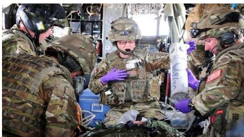
Wounded Soldier receiving lifesaving treatment whilst being evacuated by helicopter.

Our charity gives out financial support based on income generated from investments. Having reviewed our needs, we have been working to raise the profile and add £4M to this investment pot in order to secure the legacy for future generations of the Scots Guards family. A few examples of our work are as follows: