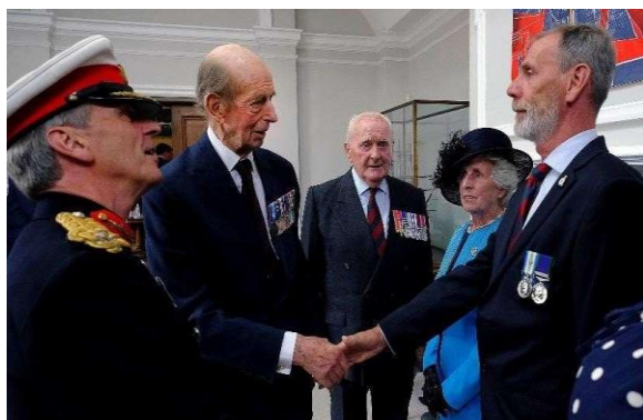
The Duke of Kent, Colonel of the Scots Guards being presented to Scots Guardsmen who served with 2SG in 1982.

The charity is a company limited by guarantee. It is affiliated to the Confederation of Service Charities which requires a bi-annual report on compliance with governance best practice, tested against their comprehensive review template. The overarching body responsible for efficient management of the charity are the trustees. New trustees are recruited from serving or retired members of the regiment or from supporters with relevant qualifications. Candidates are chosen because they are seen to have skills and experience which complement or reinforce those of existing trustees. Aspiring trustees should serve on one of the sub-committees before joining the main board. The Trustees meet twice a year when policy concerning the charity is discussed and decisions made.