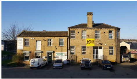
Young Masters Visual Art School Upper Ashley Lane Shipley BD17 7DA 07753513869 youngmasters@idleartstudio.com www.facebook.com/YoungMastersVisualArtSchpool