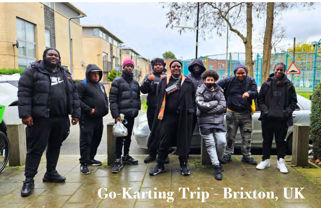
Go-Karting Trip - Brixton, UK

“I like it here. CHIPS is a comfortable and expressive space.”