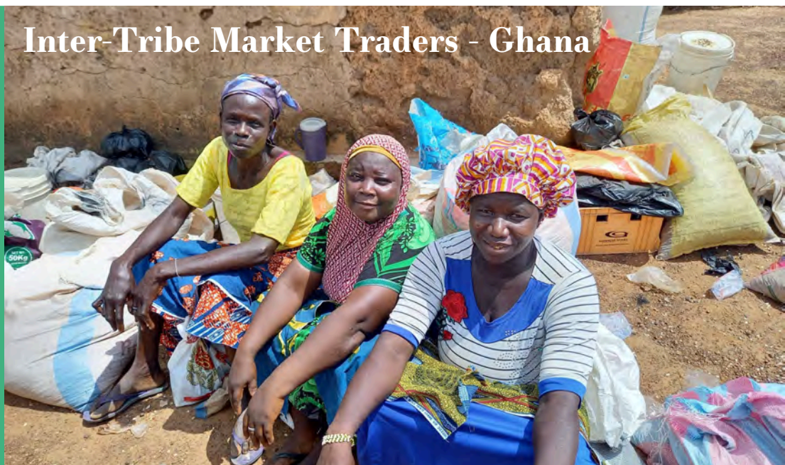
Inter-Tribe Market Traders - Ghana

“Through trading together, we see the benefits of our collaboration and our ability to support each other through hard times.”