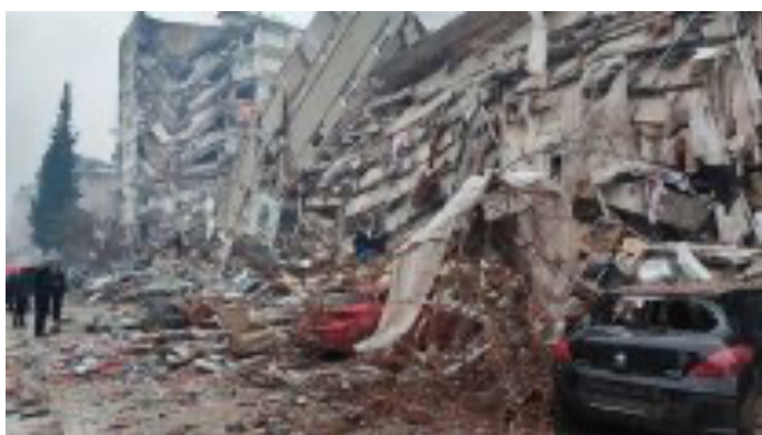
Scene from Turkey after the Earthquake

The club has made international disaster aid donations through the Lions Clubs International Foundation, for the Turkey Earthquake appeal.