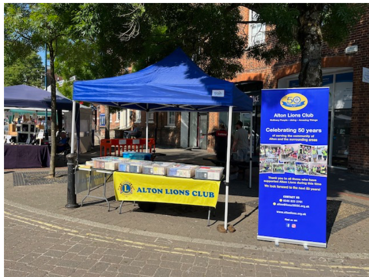
Lions Craft Market stall before the start

In addition, the Club organised it's 50 th Charter Celebration which included volunteers from past and present.