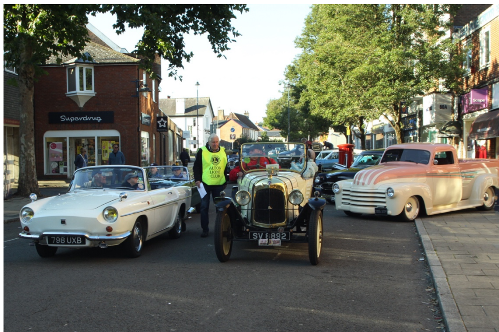
Car Show Arrivals