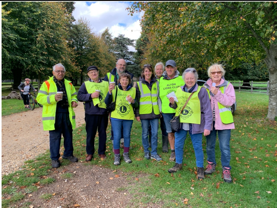
Alton Lions Marshalls after the Chawton Challenge race