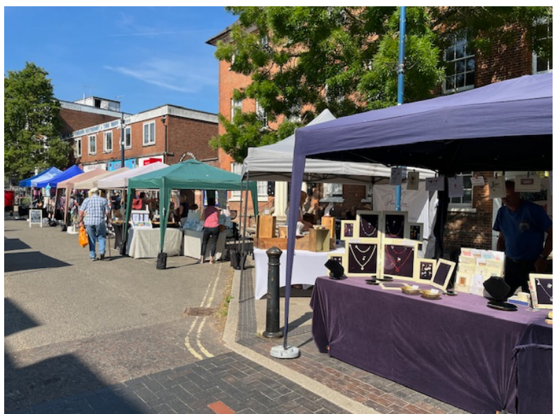
Part of Craft Market at the start