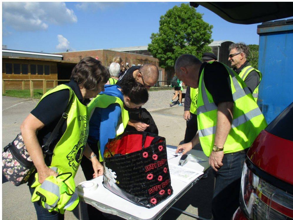
Organising the Race Marshalls for the 10 mile Road Race