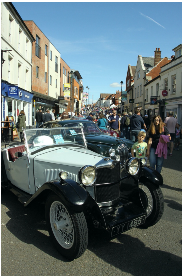
Car Show in Full Swing