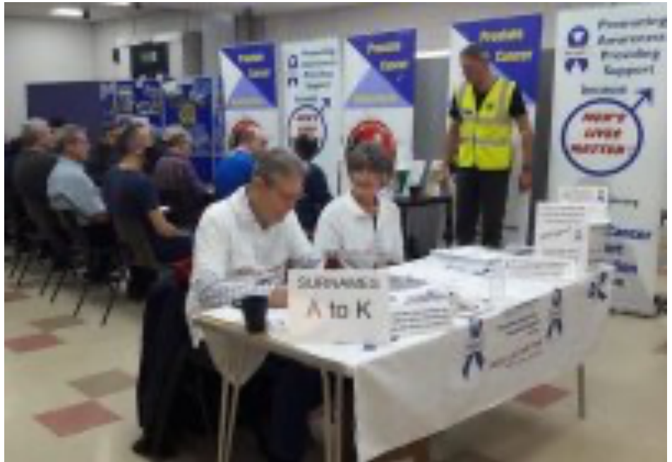
Prostate Testing Day

The club has promoted diabetes awareness through the bus stop poster campaign. Organised and delivered a prostate testing day with PCaSO at the Alton Community Centre this resulted in identifying folk at risk of prostate cancer. The club has now achieved over 1000 tests.