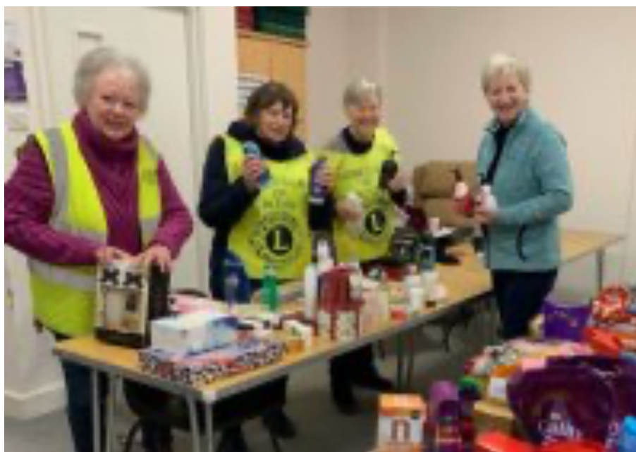
Parcelling up gifts for Christmas