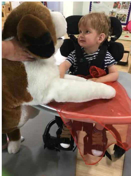
Bernie the St Bernard at Treloar's