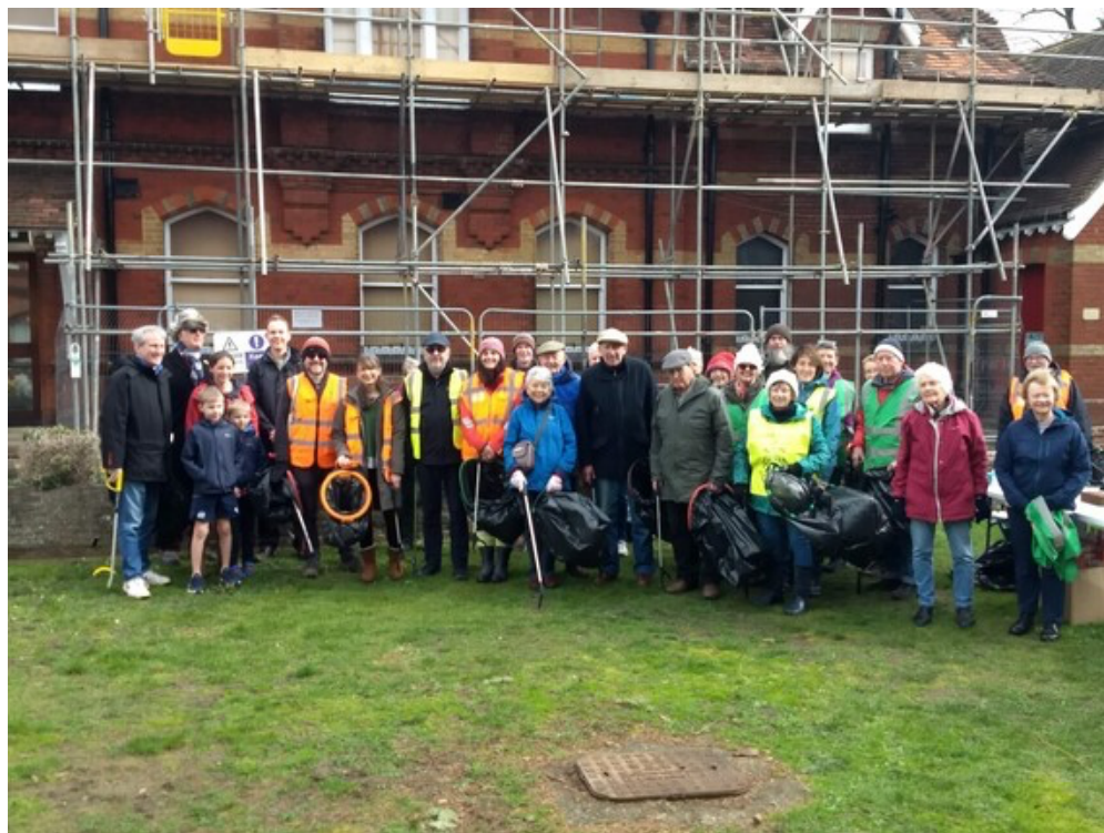
Litter Picking Team

The club has continued its 'litter pick' support with the Alton Society and Alton Climate Action Network organisation and is investigating other potential projects.