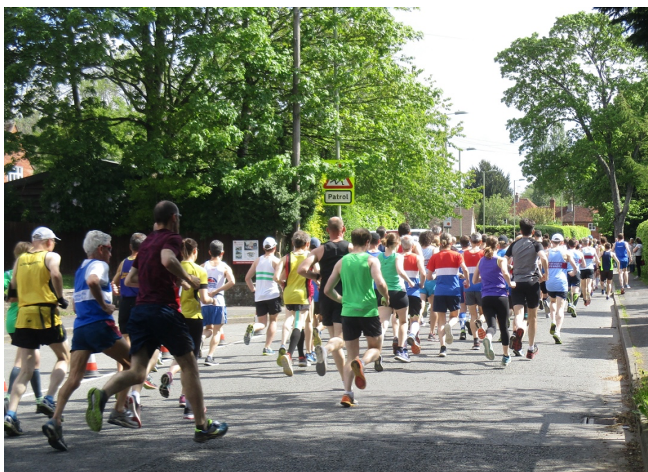
And the runners are off