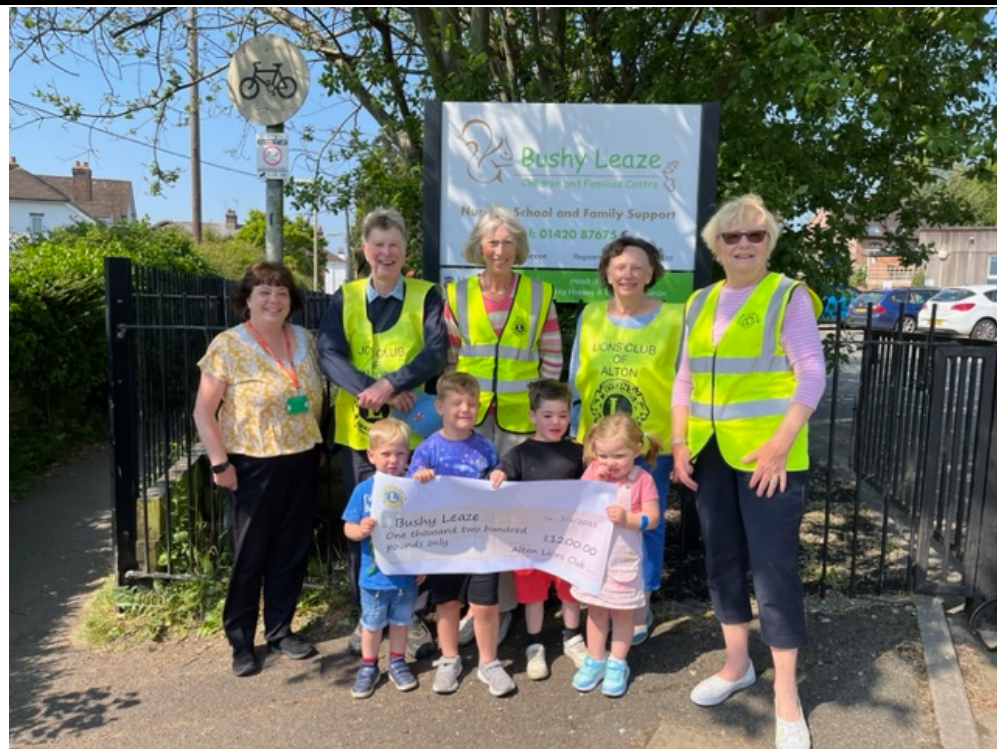
Cheque from Eggstravagnza for Bushy Leaze