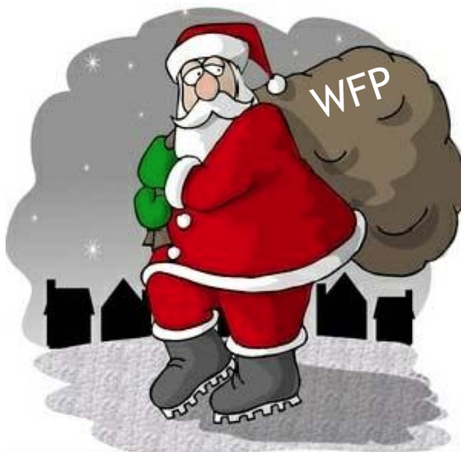
Winter Fuel ICON