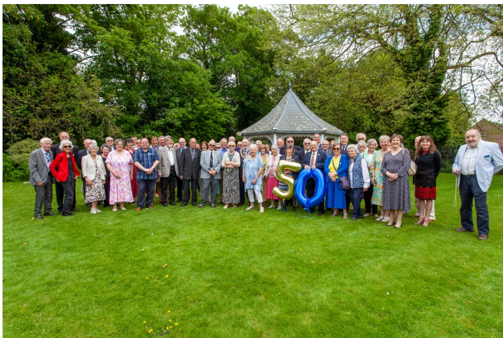
Club's 50 th Anniversary