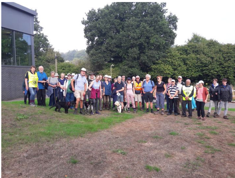
Sponsored Walkers Ready for the OFF