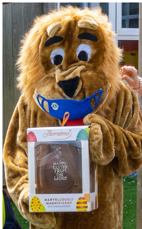
Alton Lion with the Eggstravaganza Egg

Lions Clubs International British Isles & Ireland