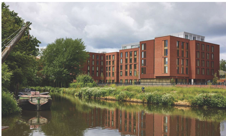
Bankside, Walnut Tree Close