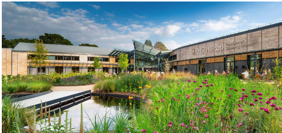
RHS Hilltop Wisley