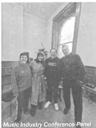
Music Industry Conference Panel