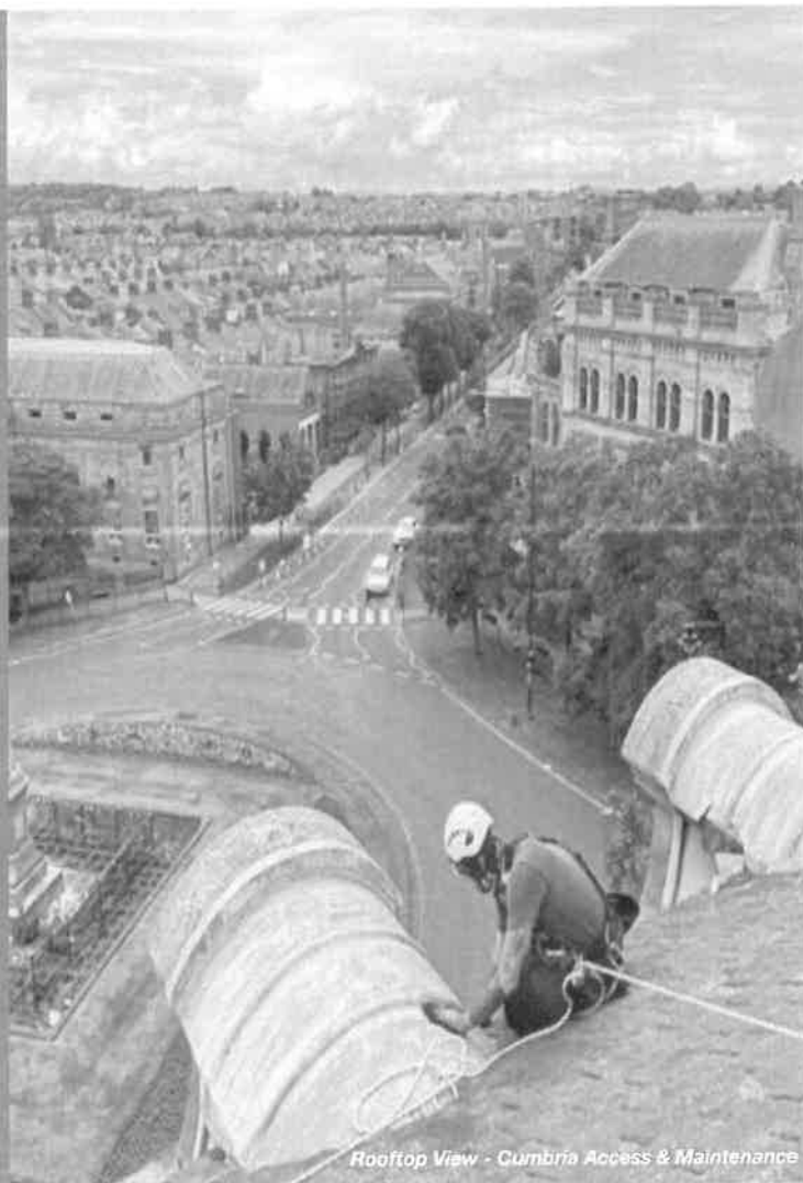
Rooftop View - Cumbria Access & Maintenance

Looking ahead to next year, we will be seeking further funding for building development, expanding our offer of instrumental & vocal tuition alongside the development of a diverse concert programme.