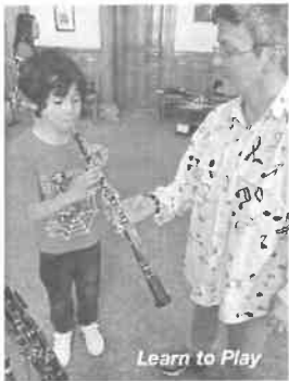
Learn to Play