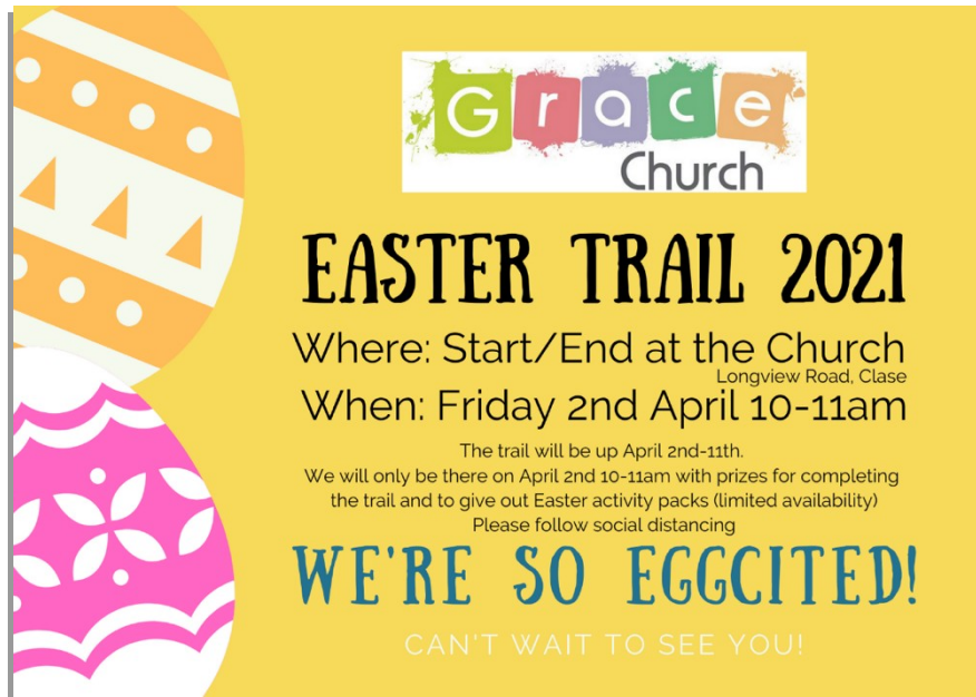
Photo Scavenger Hunt

We began in April with an outdoor Easter trail event. We created a treasure hunt around the community revealing parts of the Easter story. Families were to follow the trail and answer the quiz questions with information from the posters around the community. We created craft packs and gave out Easter eggs as prizes for completing. It was so great to be putting on an event again and to be talking to the residents that attended. We saw new faces who had not come to any of our events before, this was really exciting. We had around 10 local families attend as well as others connected to the Church family.