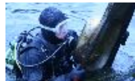
THE DIVERSITY OF LITTER IS STAGGERING. WE HAVE EVEN FOUND THE KITCHEN SINK!