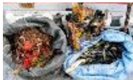
OUR RECORD IS 730 ANGLING WEIGHTS IN 1 DIVE AT STACKPOLE QUAY