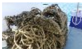
LOST LOBSTER POTS IN SKOMER MARINE NATURE RESERVE