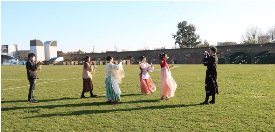
Members in Hanfu playing on the grass at Mudchute park.

In March 2022, we visited the Mudchute Farm. Experiencing a relaxing day with the farm’s animals and the spring scenery.