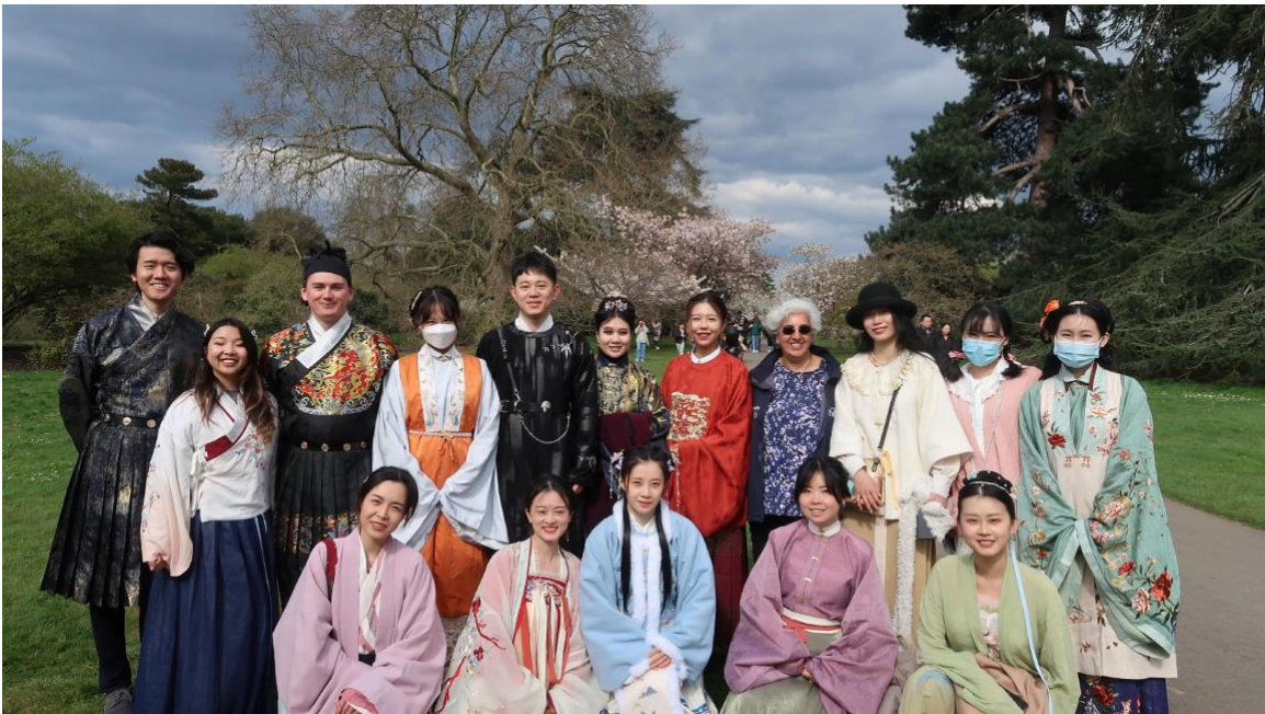
Photos above: Members listening to our tour guide at the Kew Gardens, and group photo for the Kew Garden visit.

In June – July 2022, we collaborated with Chinese Food Festival. We acted as fashion history consultant and helped creating promotional materials for the Chinese Food Festival 2022.