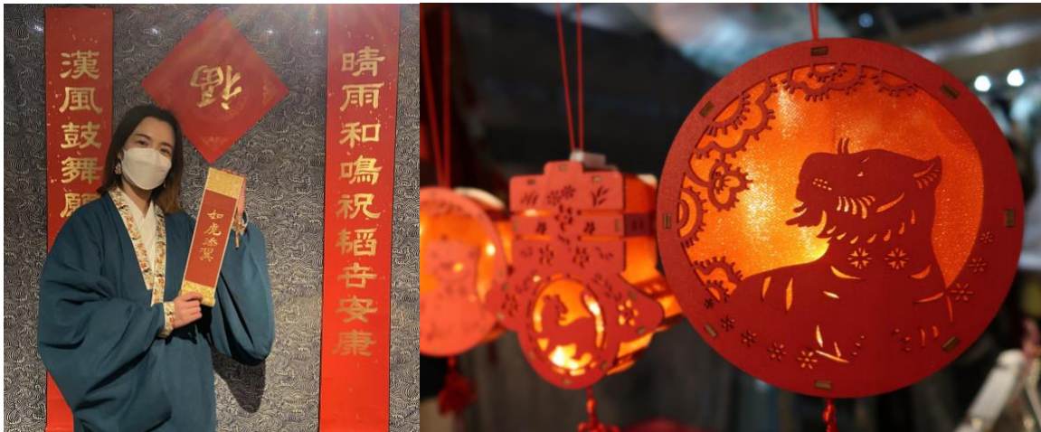
Pictures above: Members showing off calligraphy work and a “showcase” of the lanterns