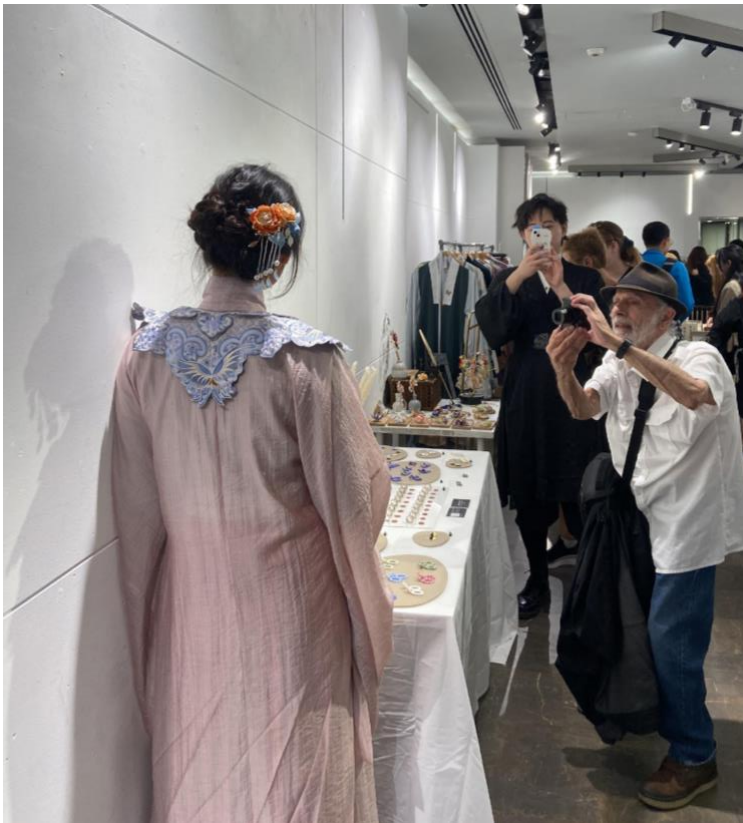
Photo on left: Participants of the event taking photo of our Hanfu model

In September 2022, we participated in a Mid-Autumn Festival celebration event held by a Bond Street based pop-up shop with calligraphy work shop and Hanfu showcase.