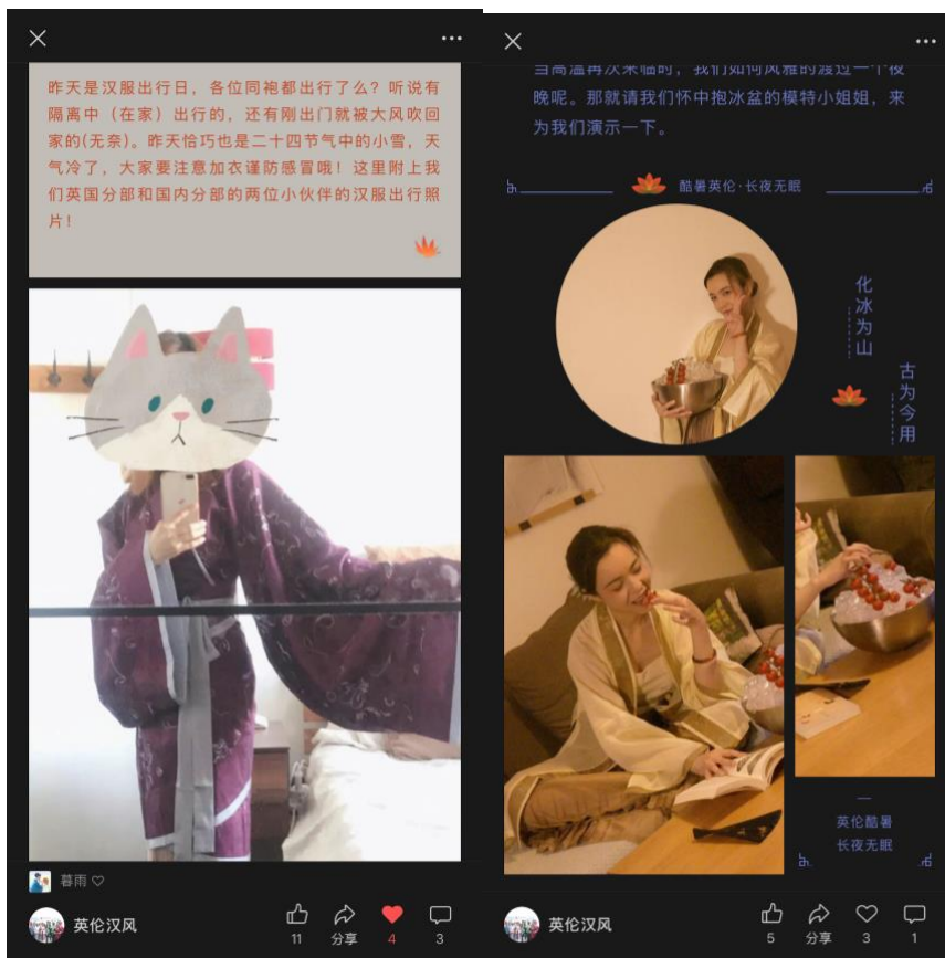
Pictures on left: We shared in our inbox Hanfu outfits our members put together at home.

We started a WeChat (Chinese messaging app) group for members, holding over 300 members throughout the year. Members continue to share culture learning resources, Hanfu fashion outfit-of-the-day (OOTD) pictures, and support each other during the lockdowns.