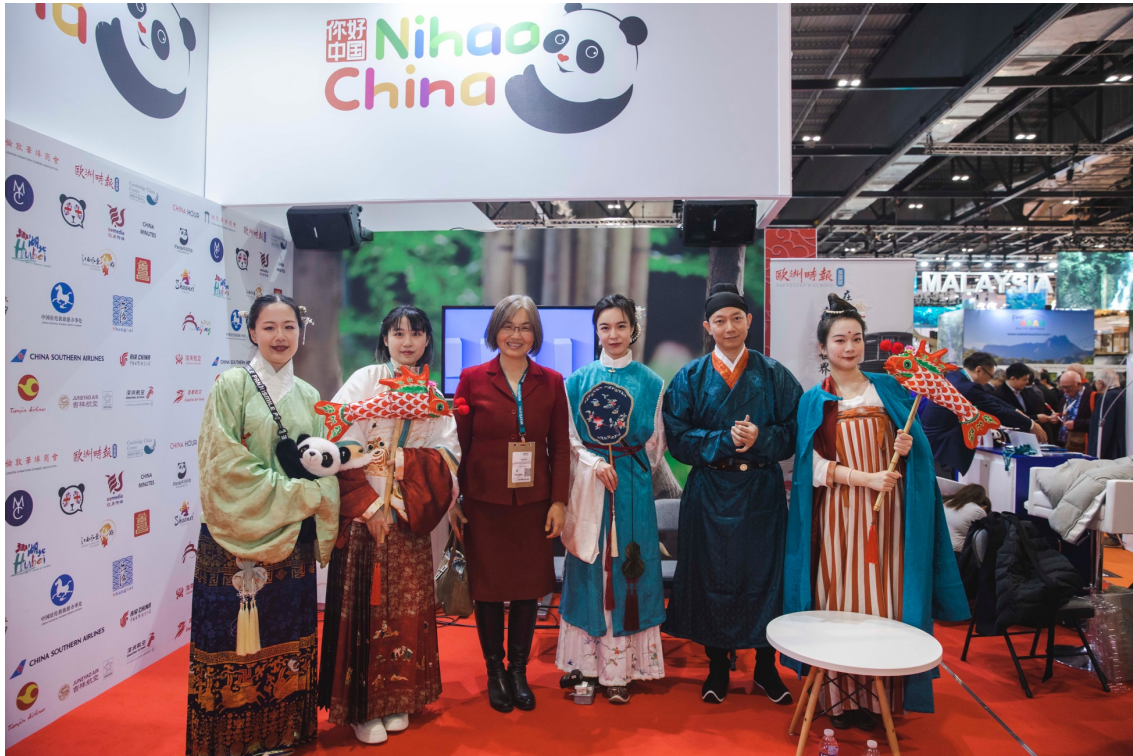
Picture above: Five of our Hanfu volunteers with a staff member at the Nihao China stall

Also in November, we organised for members to connect with each other and also with local history in London by visiting the Royal Naval College and its stunning Painted Hall. Our guide and pensioner at the College commented that it was their first time seeing traditional Chinese Hanfu clothing in person. This cultural exchange experience built up our community's bond but also spread our representation of the traditional Hanfu clothing in London.