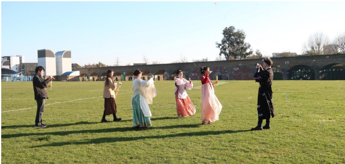
Picture above: Members in Hanfu playing on the grass at Mudchute park.

In March 2022, we visited the Mudchute Farm. Experiencing a relaxing day with the farm’s animals and the spring scenery.