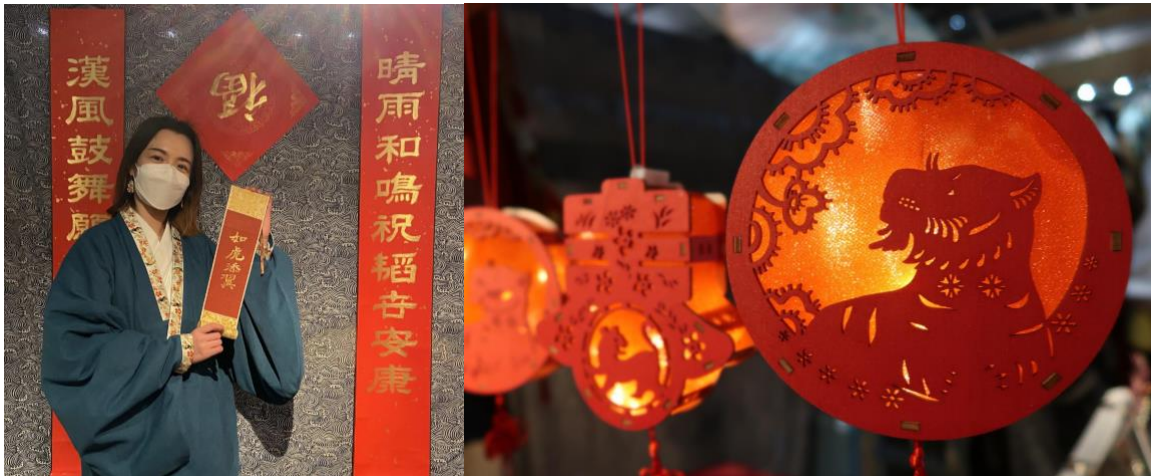
Pictures above: Members showing off calligraphy work and a “showcase” of the lanterns