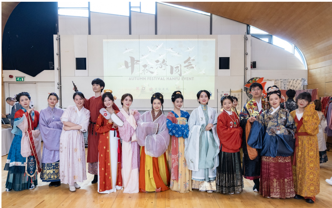
Picture above: The volunteers and performer's group photo of the event

Also in September, we co-hosted a larger scale Mid-Autumn Festival Event. The Mid-Autumn Festival used to be a big festival for the organisation. We held performance shows in the past before the pandemic, but was unable to do so since our capacity was seriously impacted. Therefore, this is a milestone in our development.