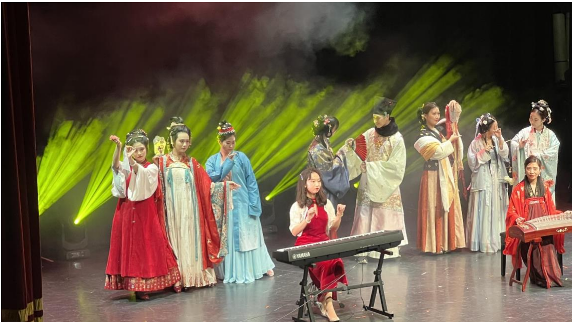
Photo above: Our ending post at the CSSA UK Chinese New Year Gala 2023

In January 2023, as part of the Chinese New Year celebration, we organised and performed a Hanfu fashion show at the CSSA UK Chinese New Year Gala 2023.