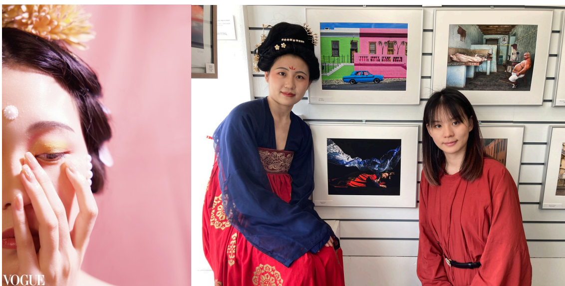
Pictures below: Some of the output of the creative collaborations, as seen in publications like Vogue, Artell and in local galleries.

During March to June 2024, we collaborated with the London based, Chinese owned photography studio – Skyidea to create multiple creative projects. Showcasing Hanfu fashion and reaching out to the local fashion industry. Our expert knowledge of the history of Hanfu provided solid grounds for creative interpretation of the clothing in modern society.