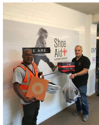
Streets4Christ & Shoe Aid UK #ReachingOut ❤️

During the pandemic we've witnessed people returning again and again on a Monday night as they are guaranteed food without judgement. People congregate in places in the City Centre that we regular visit. Its been difficult at times as some people are not interested in social distancing they just want food, clothing and grateful to speak to someone.