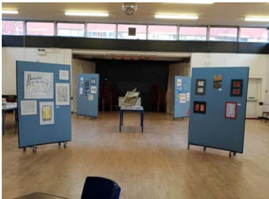
Pop-up exhibition at Whitton Community Centre