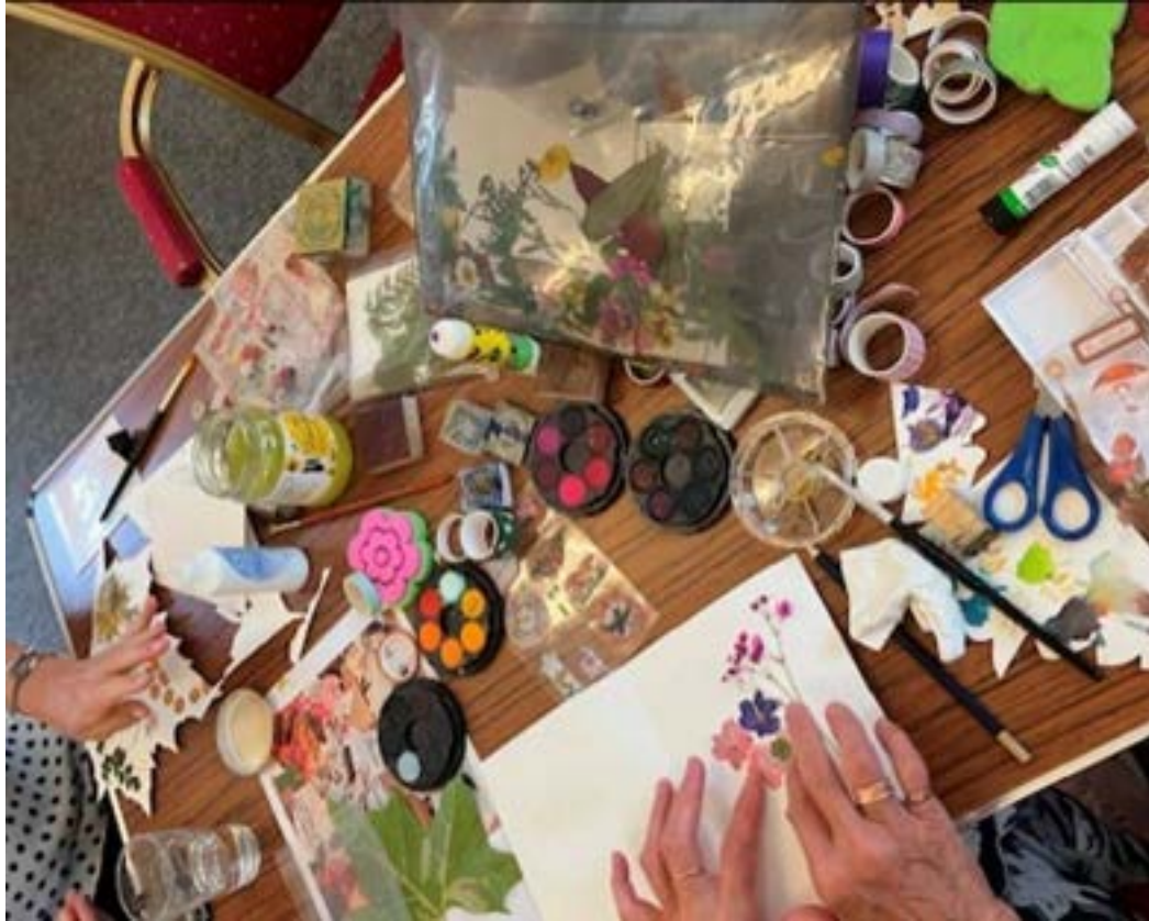
Richmond Age UK workshop in Barnes