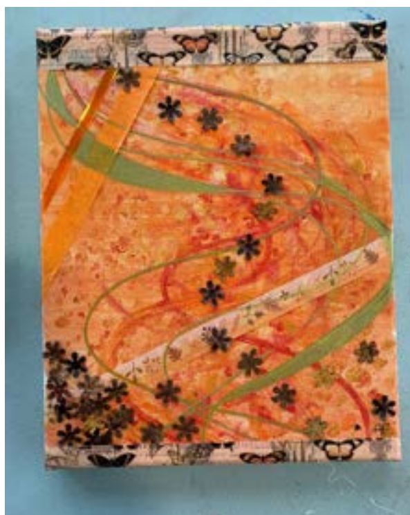
Artwork created by a new participant during a taster session