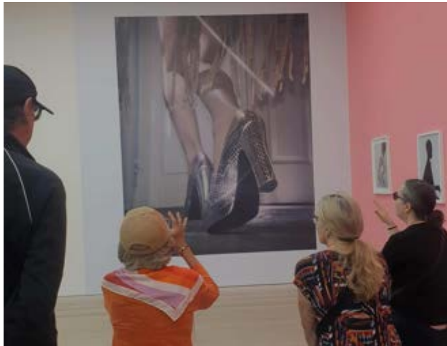
Saatchi Gallery 'Beyond Fashion' exhibition visit