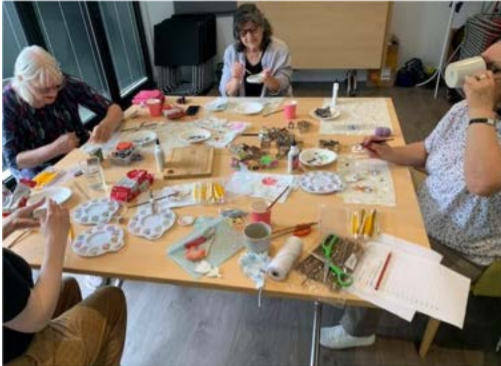
Participants at an Almshouses session creating