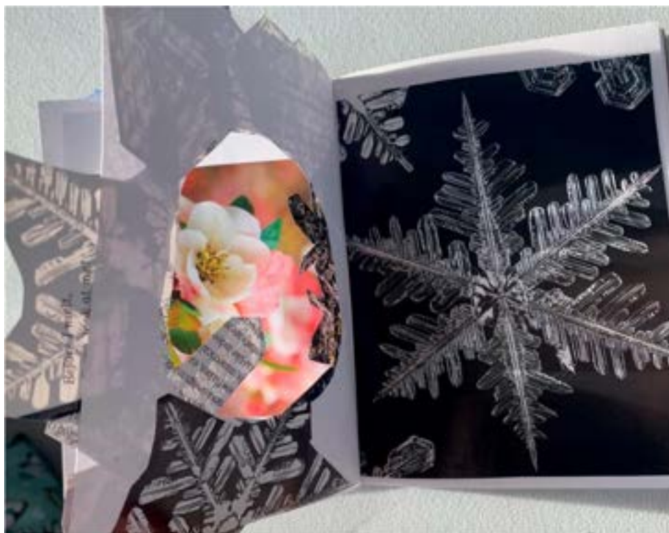
Sketchbook created by a participant during Exchange workshops