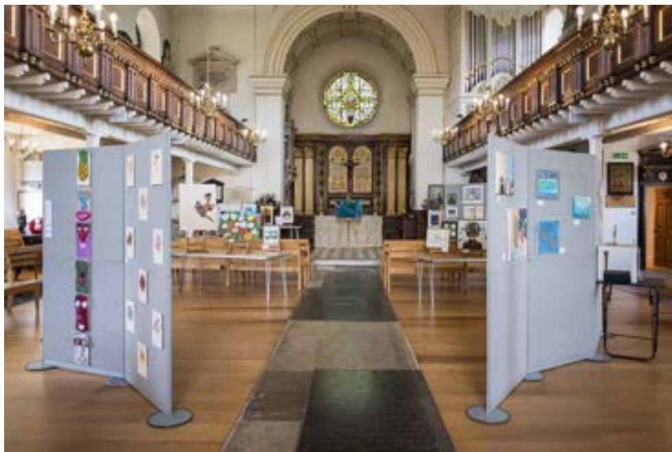
'Inner Transformations' - exhibition view (June 2024)