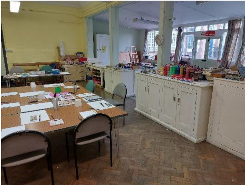
Room set up for Young People's sessions at Springfield Hospital