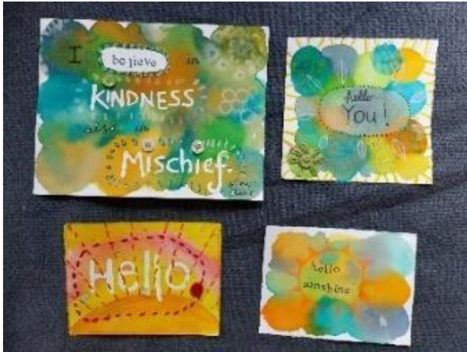
'Inspiring quotes' artworks made by adult participants at in-person sessions at ETNA Community Centre