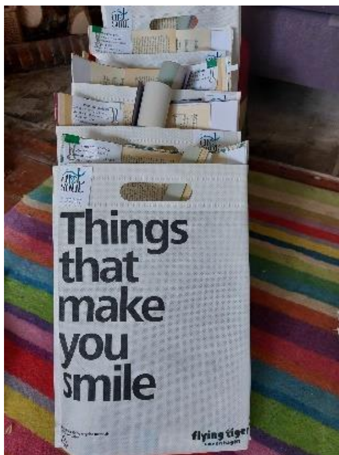
Art packs posted to young participants of the joint project with Springfield Hospital Adolescent Outreach Team