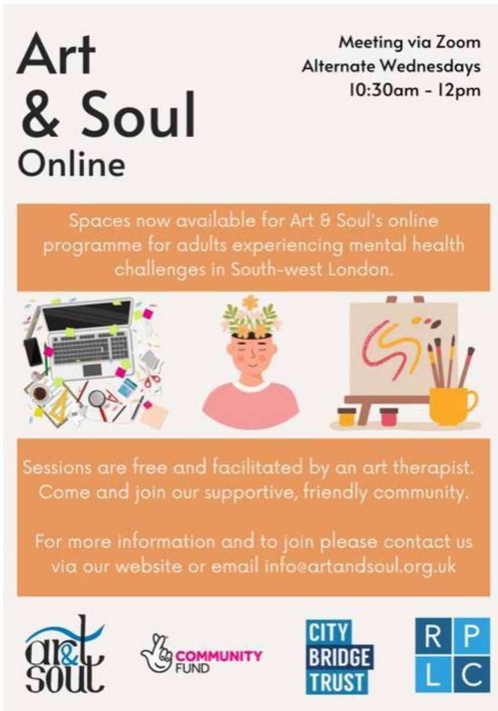
Flyer for Art & Soul online sessions for adults