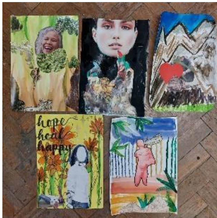
Artworks made by young participants at in-person sessions at Springfield Hospital