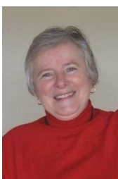
Trustee & SCC Representative