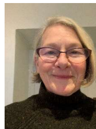
Chichlowska Trustee (Nov 2021 )