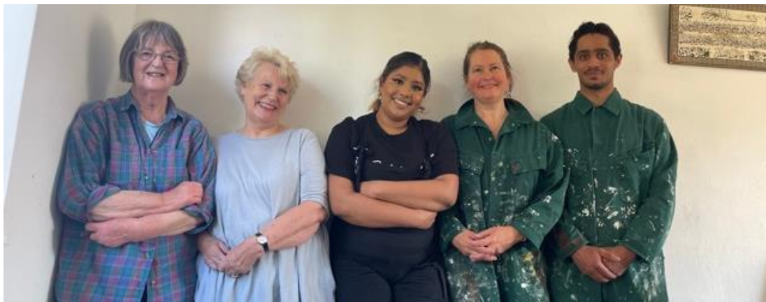
A happy team after a long and successful day of decorating.