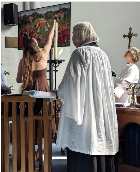
Lighting the Paschal Candle for baptism