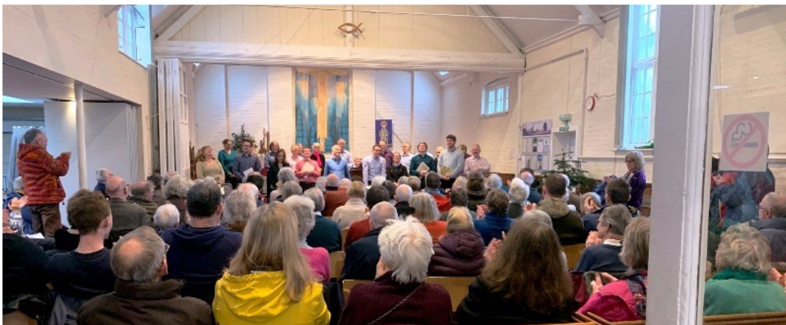
New Year's Day at St Augustine's