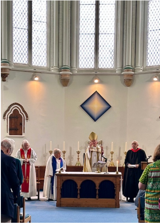
St Luke's 150 th Anniversary Service