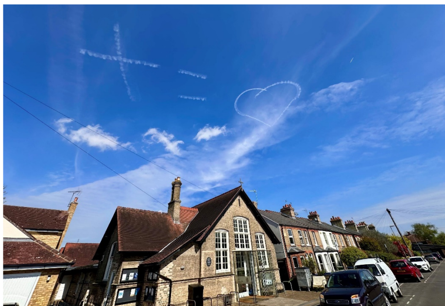
The sky on Easter Sunday 2025 over the parish