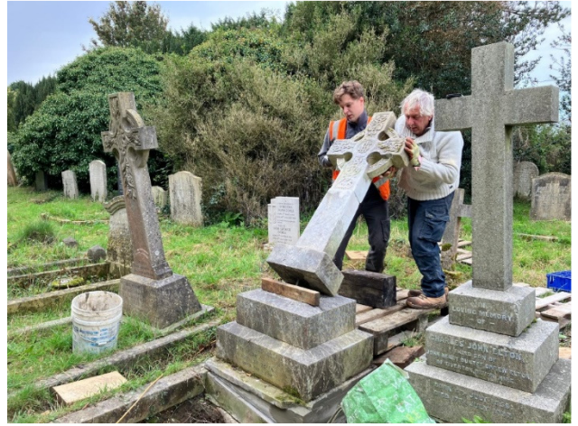
Repairs to monuments at the Ascension Burial Ground