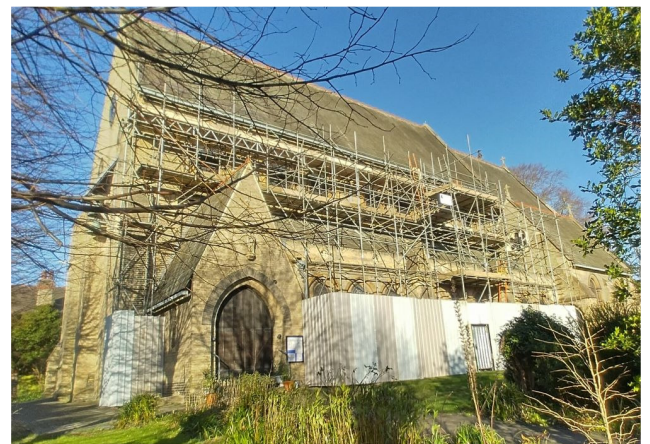
Services and community activities continued at St Giles'