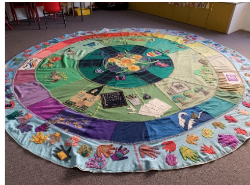
Story Quilt made by St Luke's School