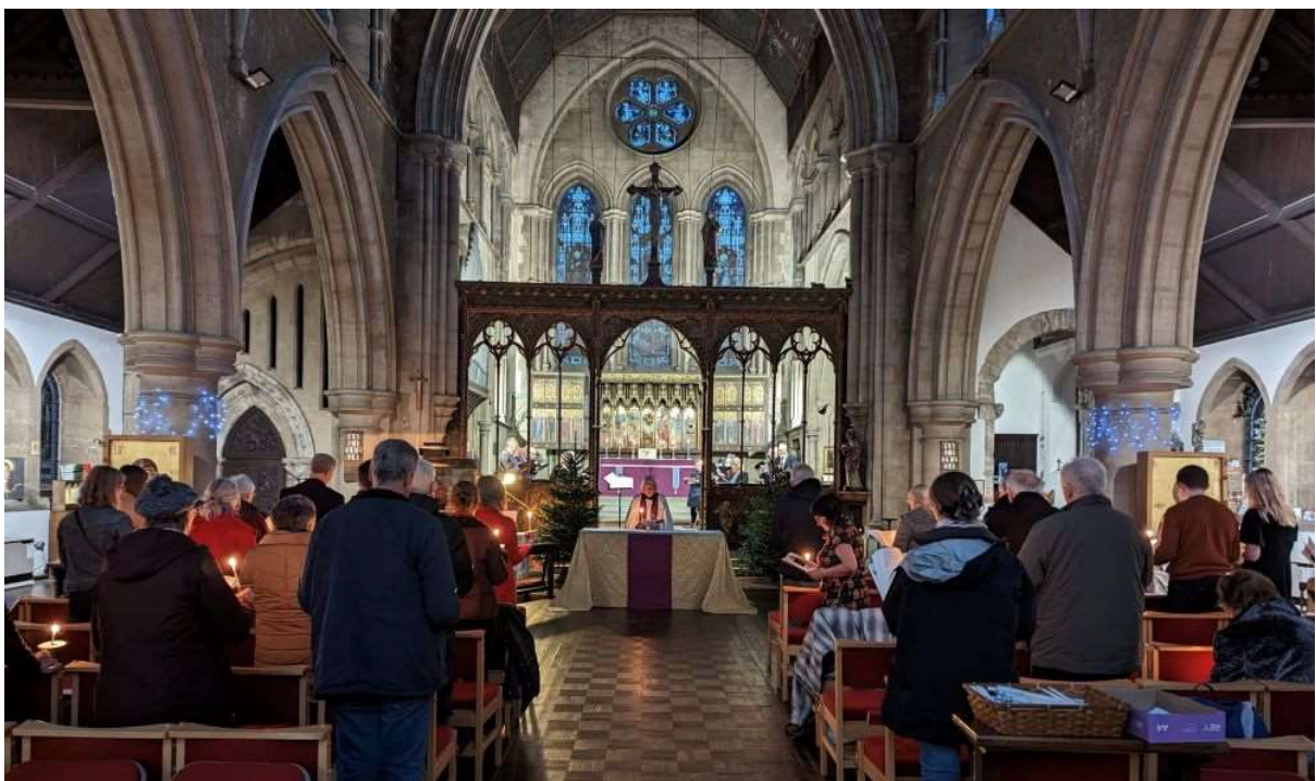
Advent Carol Service