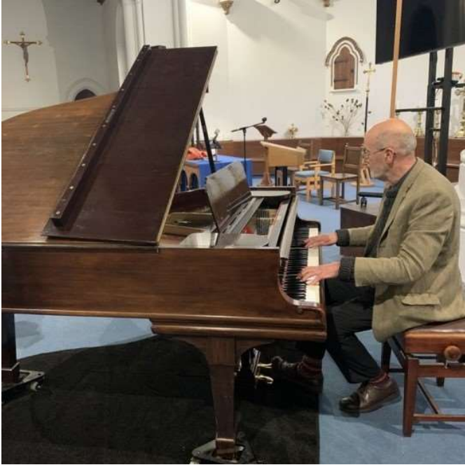
Newly restored St Luke's Steinway piano