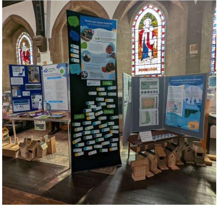
Eco Church/Cambridge Carbon Footprint Stall