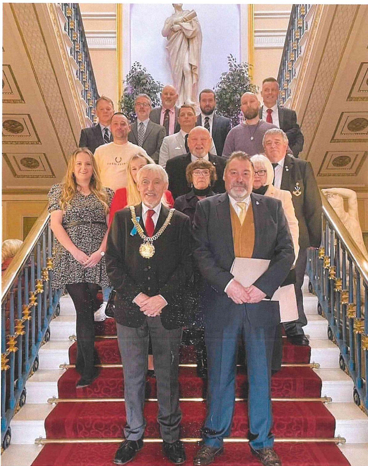
Liverpool Veterans Buddies receiving their Awards at Liverpool Town Hall from Liverpool Lord Mayor Cllr Roy Gladden.