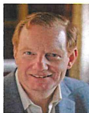
Patron Earl of Derby DL