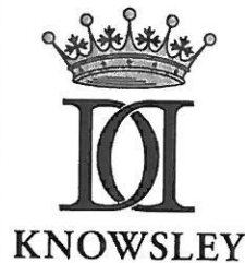
Rt Hon. The Earl of Derby Patron Liverpool Veterans HQ

With as many as 10% of prisoners being veterans, with 4% of serving personnel reporting probable PTSD, 20% reporting other common mental disorders and 13% reporting alcohol misuse, many of our Armed Forces enter civilian life with a higher risk of homelessness, substance misuse, relationship breakdown and mental health issues (especially delayed-onset PTSD) than their civilian contemporaries; combined with the unfamiliarity young single soldiers, sailors and airmen have of the housing landscape and the certainty they will not own a property; combined with the reluctance to approach the usual channels of support and advice because of the stigma and dishonour that such weakness might reveal to themselves and former colleagues, and the worrying perception within business that combat soldiers might be 'damaged goods', there is now a greater need to support our veterans than ever before at a local level.