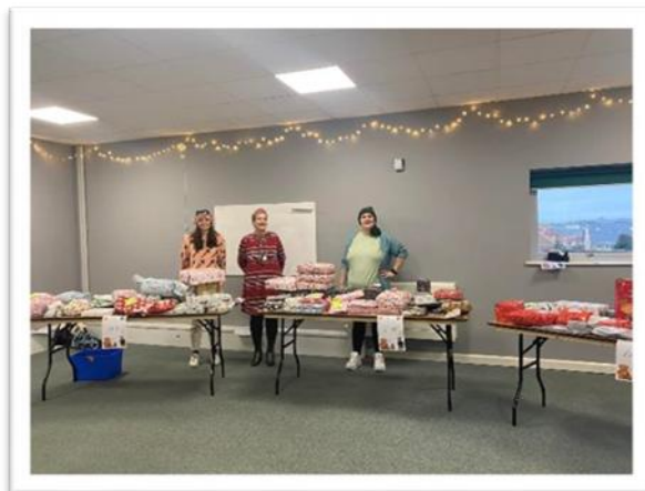
Christmas for Kids – supporting our community during the festive season