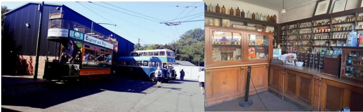
Day trip to Dudley Museum & Art Gallery in the West Midlands. This modern museum told the story of Dudley (and the wider Black Country) through time. What an insightful day out!