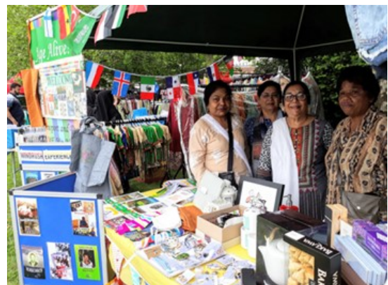
Fundraising exercise at Maindee Festival