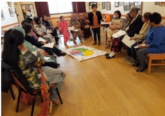
Dietician delivering a talk on healthy eating and food preparation

Dietary sessions were a huge hit, as staying healthy is a key consideration for many. Nutritional advice and healthy eating information was shared with new practices being adopted for a new outlook on maintaining an enjoyable yet balanced diet.