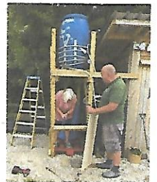
Pic1. Working on the anaerobic digester

Other improvements were to build a mobile library to hold reference books given by the community and better harvesting of the grey water.