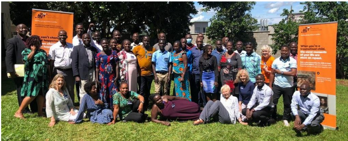
Happy end of conference photo

Delegates were selected from our database of trained CATT counsellors to represent all areas and communities across Uganda, including refugee camps, and a number worked for NGOs such as International Rescue Committee (IRC) and Christian Relief and Education for South Sudan (CRESS). Many travelled long distances hours to attend, including 4 from Arua in the far north of the country.