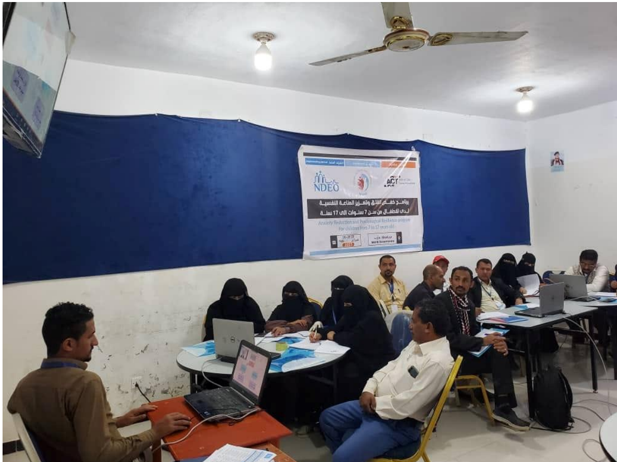
Mareb training room February 2023