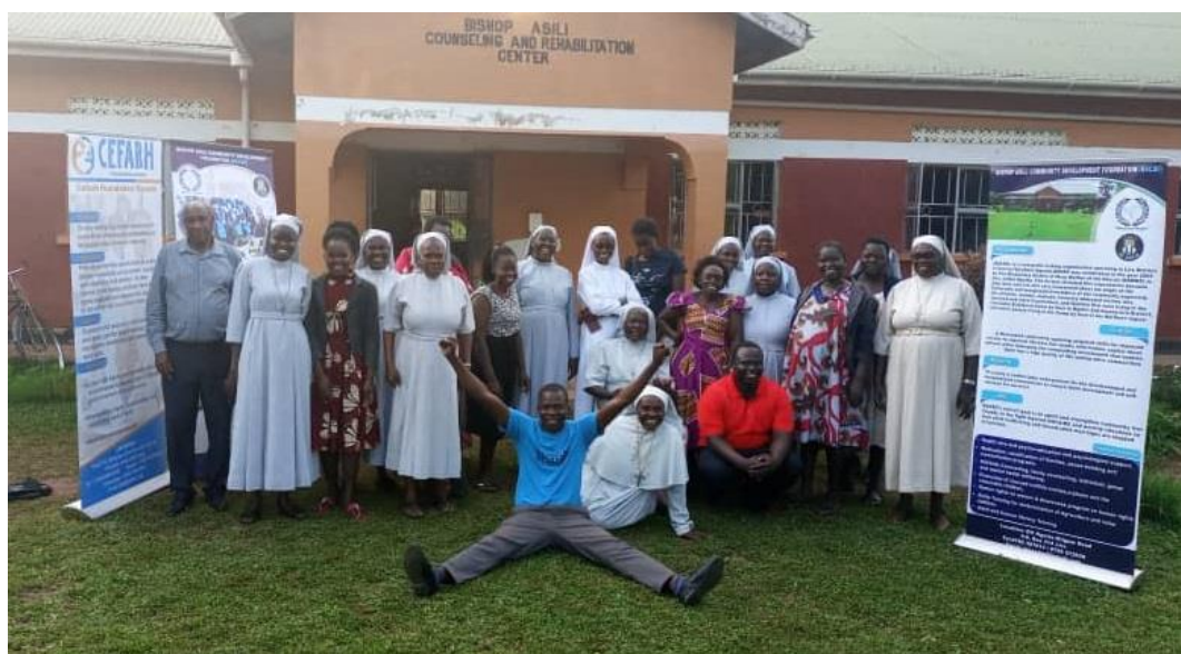
CATT trainees outside Bishop Asili in Ngetta