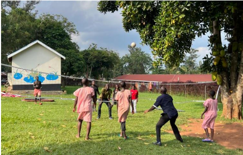
Volleyball in the children's ward grounds at Butabika Hospital