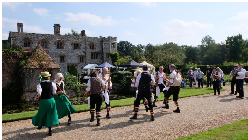
Morris dancers at Mannington Hall

HE UK was accepted to take part again in The Big Give Christmas Challenge, a national fundraising campaign run annually at the beginning of December. Our 'project' was to raise £9,000 to fund the development of palliative care at St Paul's Hospital in Addis Ababa. Staff at the Oncology and Emergency departments will be trained using the Federal Ministry of Health (FMOH) Training and Delegates manuals (developed with funding from The Big Give project 2020). To raise this amount, we needed our donors to give £4,500 which was then matched to raise £9,000 in total. In fact, our donors gave more and with Gift Aid the total raised was over £10,000. A fantastic result, which we could not have achieved without so many generous donors taking part.