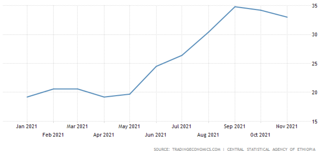
Graph showing inflation rate in Ethiopia in 2021

equipment, therefore the money we transfer is rarely ring-fenced, allowing the Director and Accountant to spend the money as they think best for providing palliative care. Next year we again plan to transfer two payments, thus minimising bank transfer fees. However, with inflation running at approximately 30% and the value of the Ethiopian Birr dropping against pound Stirling (see graphs below), careful planning with Hospice Ethiopia will be needed as to the best time to transfer the funds.