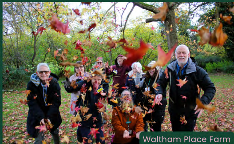
Waltham Place Farm