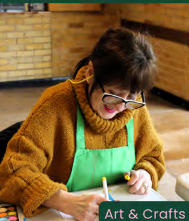
Art & Crafts