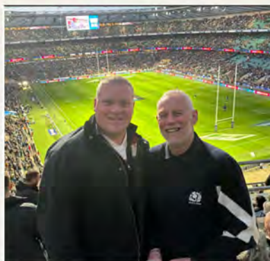
England vs Scotland