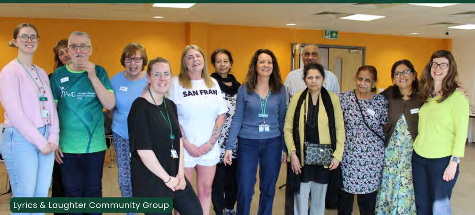
Lyrics & Laughter Community Group

The project has benefitted greatly from shared learning, skills and collaboration. In parallel, we are running a research project, approved by Northumbria University ethics, to better understand what encourages people to engage in health-seeking behaviours.