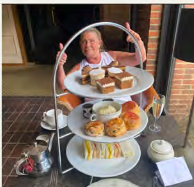
Afternoon tea at the spa

These moments created lasting joy and treasured memories for individuals and families alike.