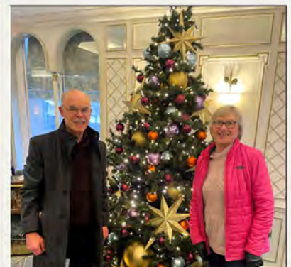
A day trip to London