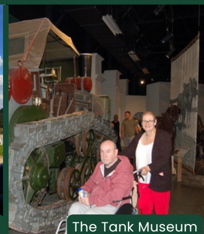
The Tank Museum