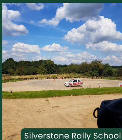
Silverstone Rally School