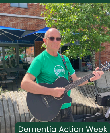
Dementia Action Week

“All Together Now” events were first introduced in the charity with the aim of bringing together our service users and their loved ones. Our charity ran a number of events in 2023 and 2024 which included a barn dance, a 1970’s disco, a Christmas meal and pantomime trip and a beach trip to Boscombe.