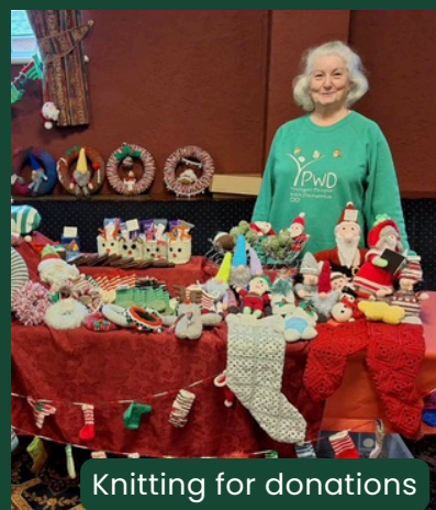
Knitting for donations