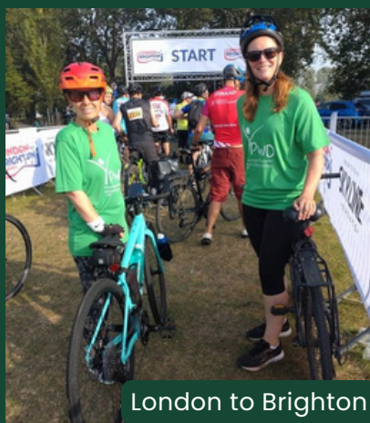
London to Brighton