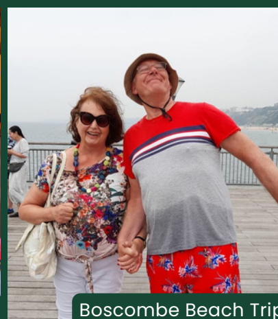
Boscombe Beach Trip