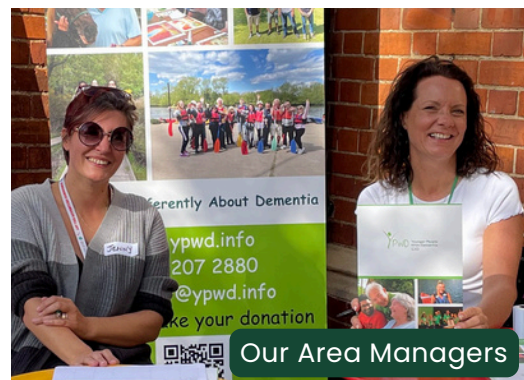
Our Area Managers