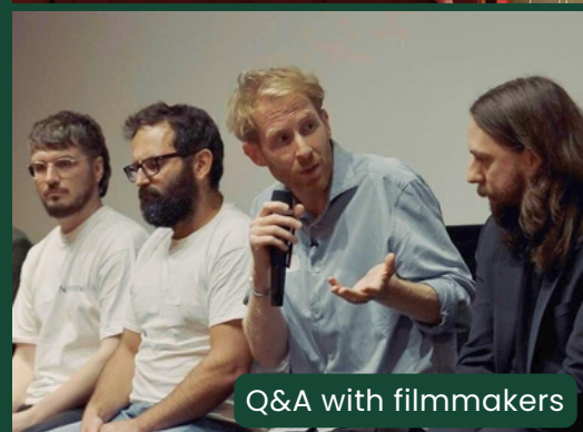
Q&A with filmmakers