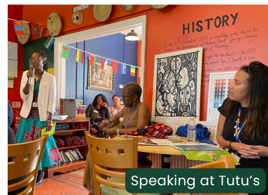
Speaking at Tutu's

Attendees included healthcare professionals, community leaders, policy makers and individuals who helped us in fostering dialogue, sharing experiences and collaborating on solutions that address the diverse needs of our communities.