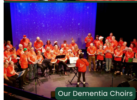
Our Dementia Choirs