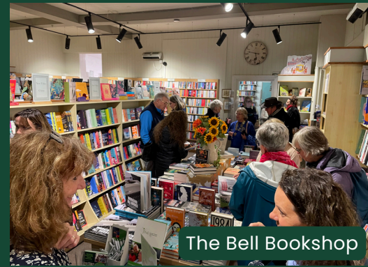
The Bell Bookshop