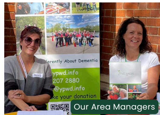
Our Area Managers