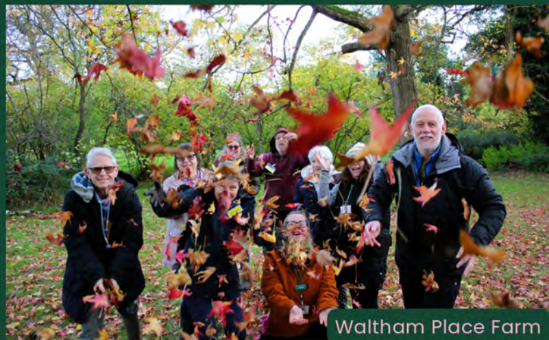
Waltham Place Farm