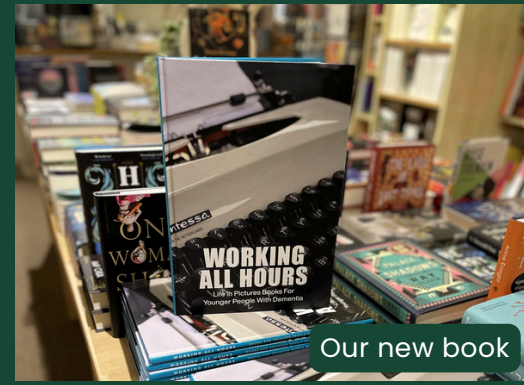
Our new book

We were really excited to launch the charity's third reminiscence book for people living with young onset dementia. The launch of "Working All Hours" took place at the Bell Bookshop, Henley on Thames, with a prosecco reception. Previous books we have produced have been "British Seaside" and "Around the World in Many Ways." Across studies, reminiscence therapy has been shown to positively influence people living with dementia and can provide a sense of overall life satisfaction and coping skills and may also help to ameliorate the symptoms of depression and dementia.