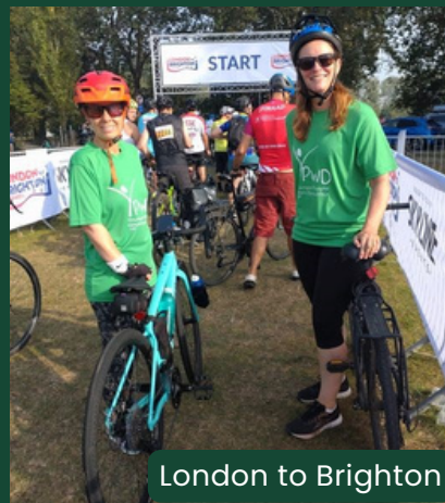
London to Brighton