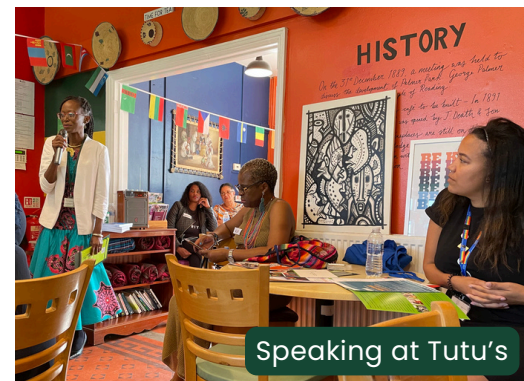
Speaking at Tutu's

Attendees included healthcare professionals, community leaders, policy makers and individuals who helped us in fostering dialogue, sharing experiences and collaborating on solutions that address the diverse needs of our communities.