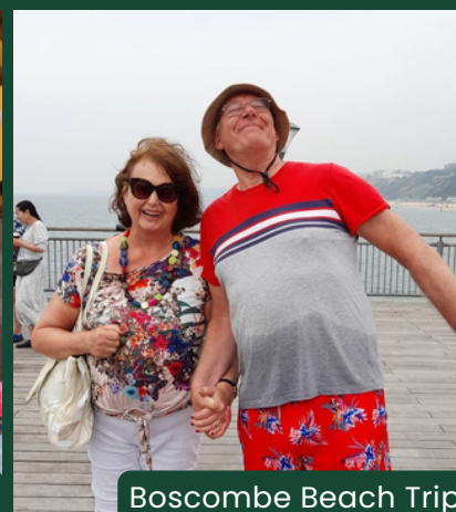
Boscombe Beach Trip