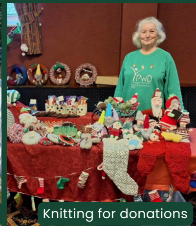
Knitting for donations