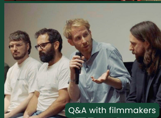
Q&A with filmmakers