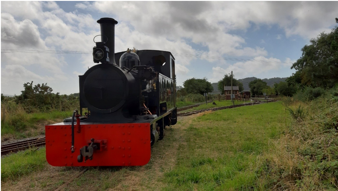
Photo – Gelert at Pen-Y-Mount

Whilst coming to the end of the pandemic, it was a challenge to engage and encourage new volunteers to work with the trust in the maintenance and development work on Gelert. However, it is pleasing that progress has continued to be steady during 2023