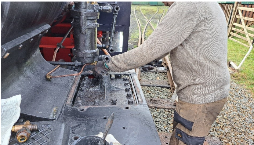
Photo – Gelert's left hand cylinder cover being removed for inspection

However, in addition to that, through a process of elimination and working back from the steam chest the noise reported in the previous operating season was identified to be a very tiny amount of slack in a bearing. This is only a small issue, but will involve a large amount of work to rectify, so it is possible that this work will need to wait until the 10 year overhaul. Again, a very useful and interesting piece of investigative work for the volunteers involved