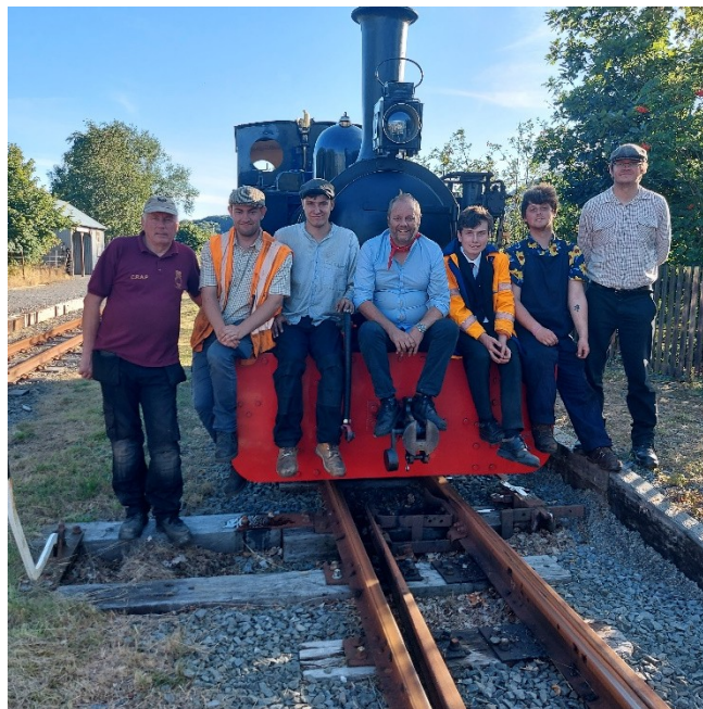
Photo – Gelert with volunteers on an evening social

The Trust continues to explore ways of securing Gelert's future, how best to celebrate the locomotive's rich heritage and educate a wider audience about the story of this popular locomotive. The Trust has worked closely with the WHHR to establish a clear partnership in maintaining and celebrating Gelert which has become popular both with volunteers and with visitors to the railway. When not operating or under maintenance Gelert is stored under cover in the Museum of the Welsh Highland Heritage Railway.