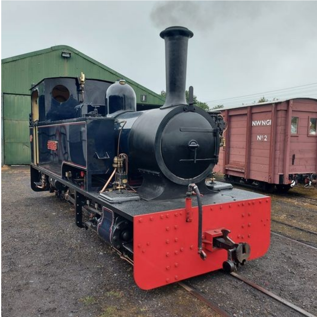
Gelert being warmed up for a day's work

Whilst coming to the end of the pandemic, it has been a challenge in 2022 to engage and encourage new volunteers to work with the trust in the maintenance and development work on Gelert. However, progress has been steady, and it is intended to build on that in 2023.