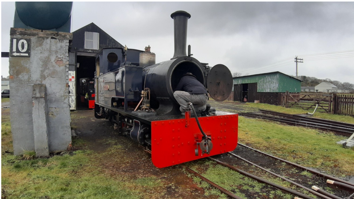
Gelert having smokebox work carried out.

The Trust continues to explore ways of securing Gelert's future, how best to celebrate the locomotive's rich heritage and educate a wider audience to the story of this popular locomotive. The Trust has worked closely with the WHR to establish a clear partnership in maintaining and celebrating Gelert which has become popular both with volunteers and with visitors to the railway. When not operating or under maintenance Gelert is stored under cover in the Museum of the Welsh Highland Heritage Railway.