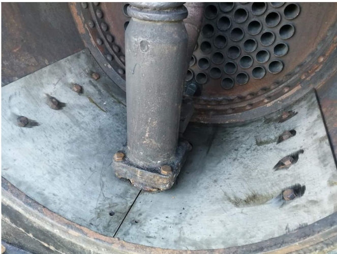
Gelert's new smokebox floor (left) and baffle plate (right) being made and fitted by our trustees and volunteers.

Another improvement planned for the future is the fitting of “breathers” which allows air into the tanks so the injectors work more efficiently, these being made by a volunteer ready for fitting when volunteer time allows. The locomotive was made ready for steam inspection in March 2022, Gelert passing this test with flying colours and allowing it to run again for the 2022 season.