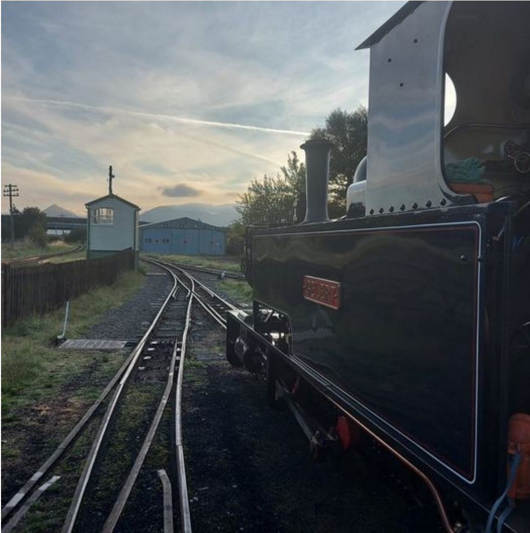
An early start.