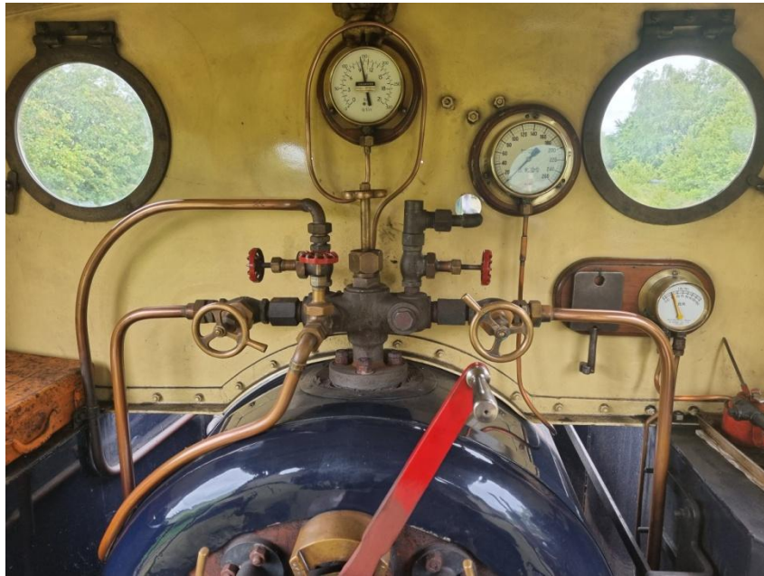
Photo - Gelert's cab controls - let us hope that soon volunteers can be polishing and cleaning these controls whilst operating Gelert during the 2021 season. (Photo by M Seale)

The Trust has been spending time considering the future of Gelert and how best to celebrate the locomotive's rich heritage and educate a wider audience to the story of this popular locomotive. The Trust has worked closely with the WHHR to establish a clear partnership in maintaining and celebrating Gelert which has become a popular locomotive with WHHR volunteers and visitors to the railway. Gelert is currently stored under cover in the Museum of the Welsh Highland Heritage Railway.