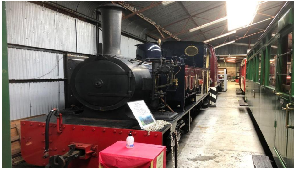
Photo - Gelert on display at the Museum/Heritage Centre at the WHHR during the summer of 2020.