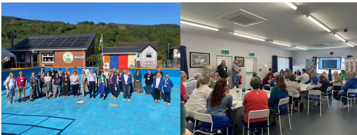
Delegates from throughout Wales

In April 2025 we hosted Building Communities Trust's 'Get Together'. Project officers and representatives from 11 participating groups spent two days at our venues exchanging ideas and best practise. It was a very enjoyable two days and trustees are looking forward to more 'Get Together' events at other venues as the project develops.